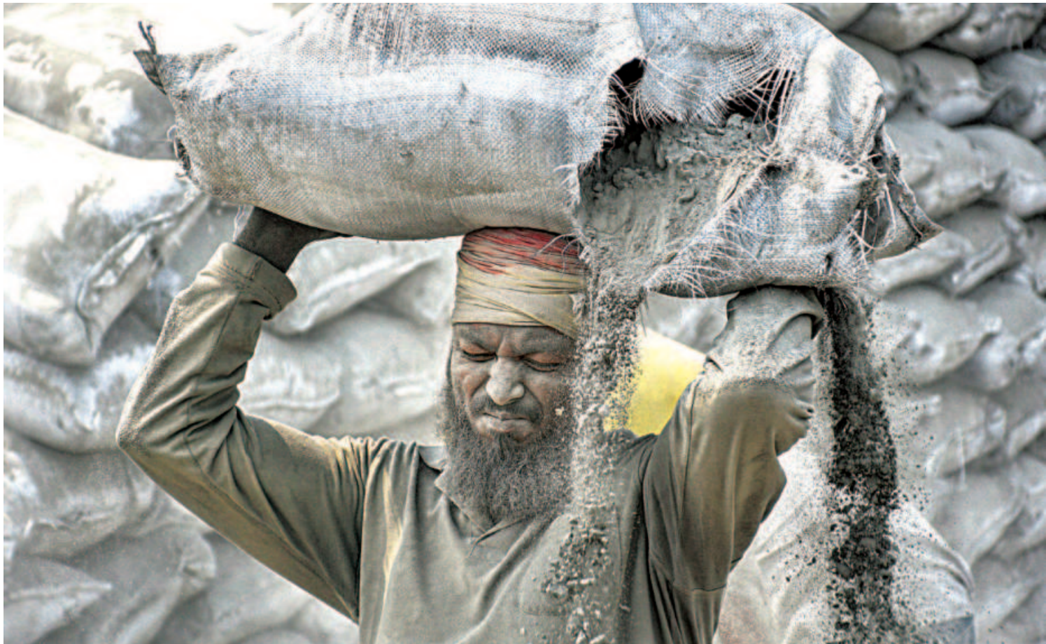
Fly ash is in the air and coating the bare face, arms and clothes of a worker carrying a sack of the waste product of burning coal. Tonnes of fly ash arrive at Khulna River Terminal every day from India to be used mainly by cement manufacturers in Bangladesh. Even though the ash contains several harmful heavy metals, no safety measures are taken by the contractors who employ the workers.