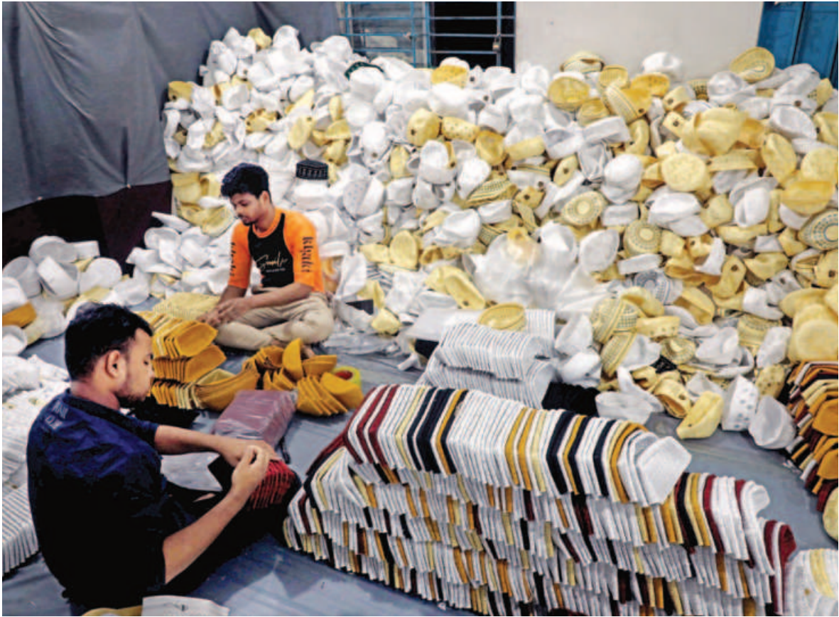
Artisans sorting out hand-made prayer caps at a small factory in Kamrangirchar. Demand for such products multiplies during Ramadan and ahead of Eid. The photo was taken yesterday.

"Our results show that even with a very small amount of egg yolk, you can achieve an amazing change of properties in the oil paint, demonstrating how it might have been beneficial for the artists."