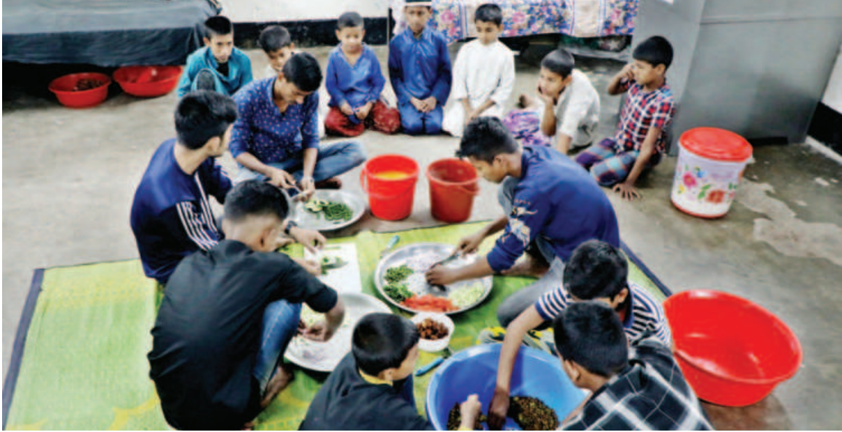
TRUE SPIRIT OF TOGETHERNESS... With smiles on their faces, the children at Sir Salimullah Muslim Orphanage come together every day to prepare iftar, creating a heart-warming scene of unity and cooperation. These children may have lost their families, but they have found a new family at the orphanage, filled with love and support. This photo was taken yesterday.