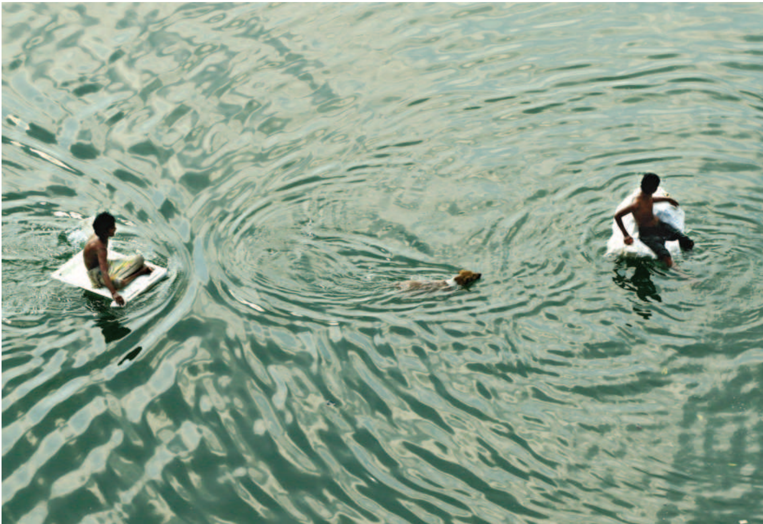
These two boys and their furry friend are making a splash in the Surma river on a scorching hot day near the Keane Bridge in Sylhet city. It looks like they're having a blast on their Styrofoam boards.