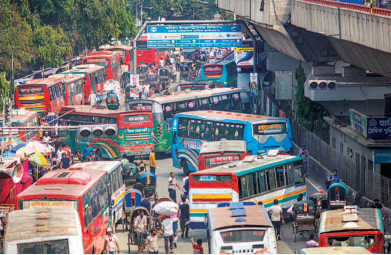
Buses pick up passengers blocking the ramp of Mayor Mohammad Hanif Flyover in the capital's Gulistan yesterday. Inter-district buses parked in the area also choke the road.