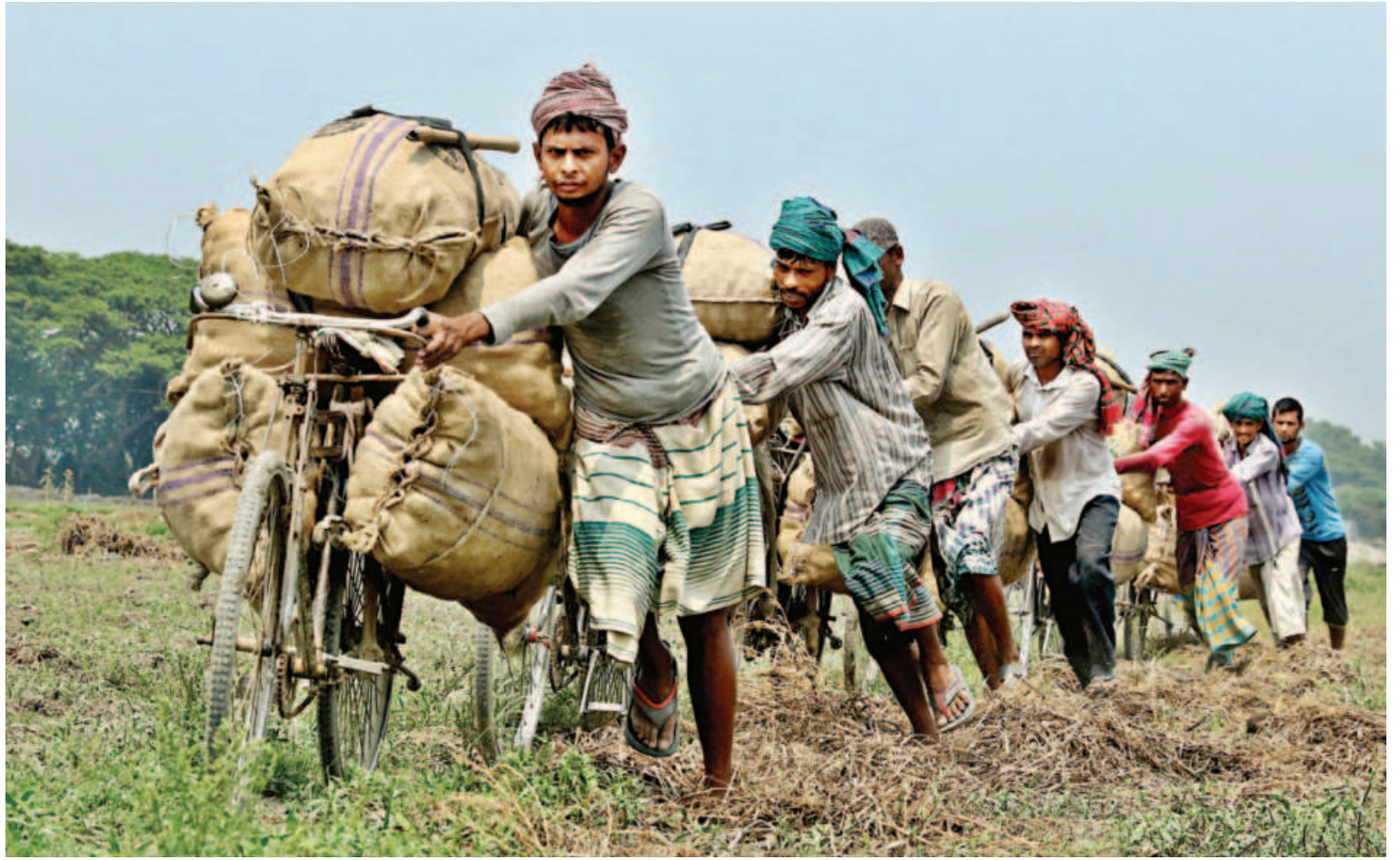
Workers at a farm in Sirajdikhan of Munshiganj push each bicycle loaded with four heavy sacks of potatoes. The growers sell each kilogram for Tk 10-12, which is about half the price one finds in retail stores in Dhaka. The photo was taken yesterday.