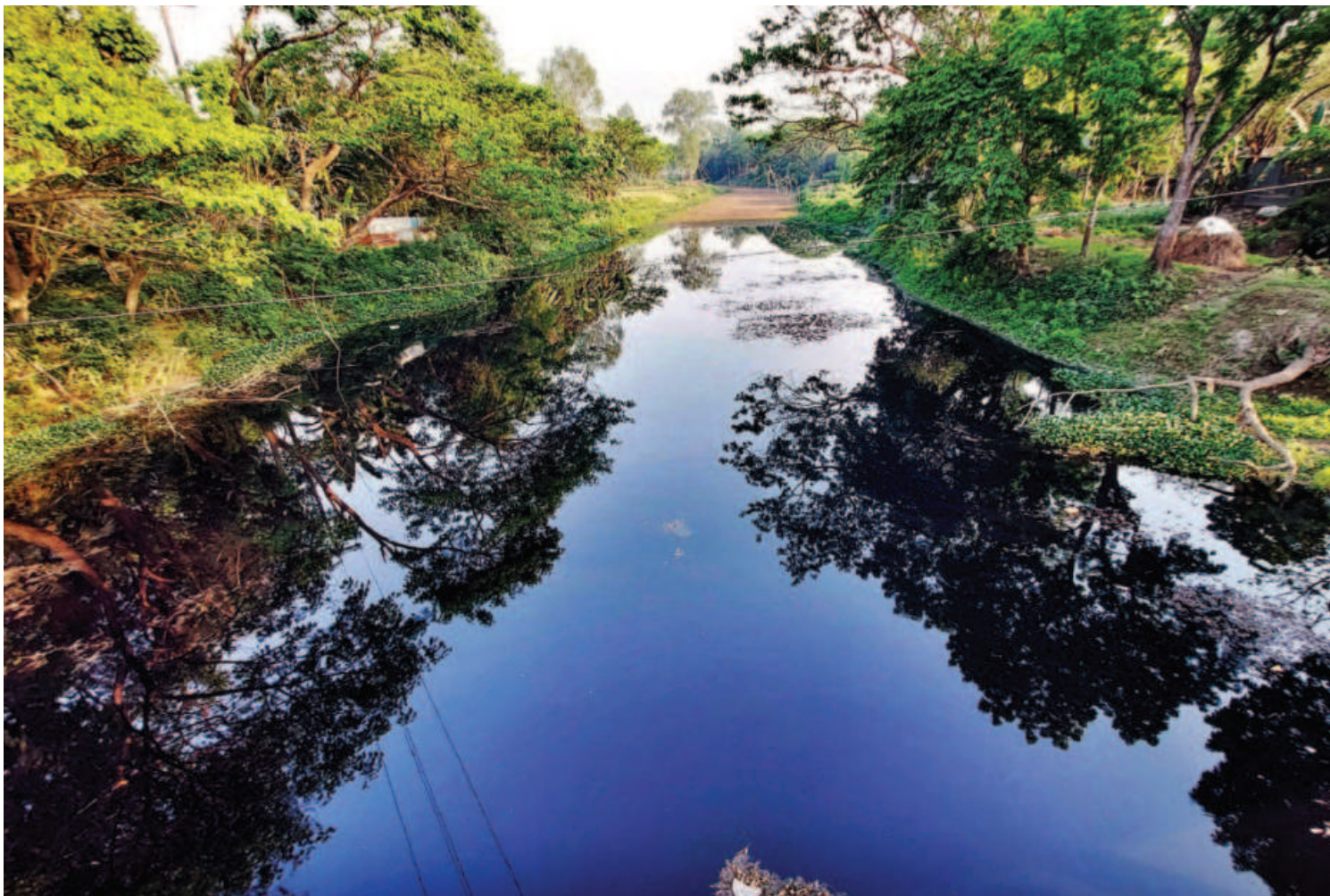
Effluents released from mills and factories into the Louhajang river have severely polluted the water body in Khudirampur area of Tangail, around four-km away from the district town. The water is now black. The photo was taken on Monday.