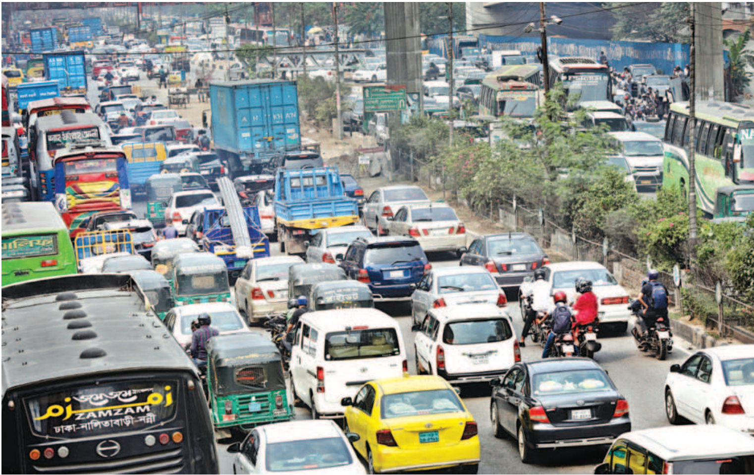
The road at Chairmanbari in the capital's Banani is gridlocked around 2:30pm yesterday, the first working day in Ramadan. Many roads in the city were clogged with bumper-to-bumper traffic in the afternoon.