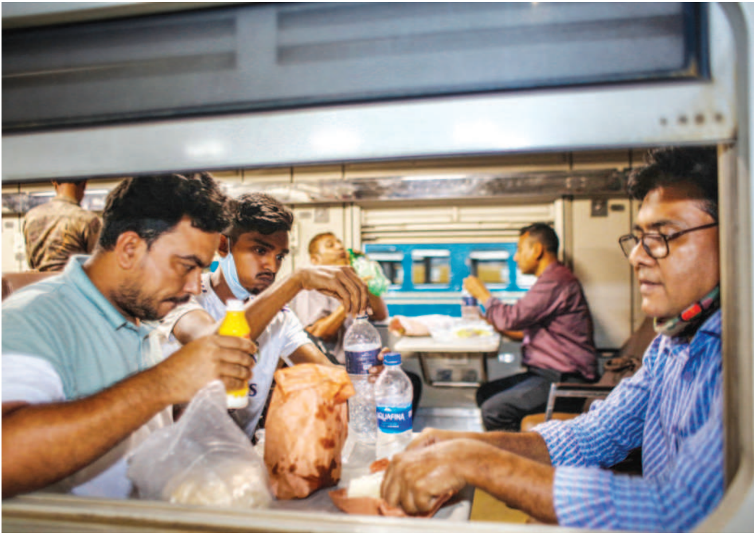
Passengers were seen breaking their fast sitting inside the trains at Kamalapur Railway Station yesterday. They purchased iftar items from shops adjacent to the station and shared them amongst themselves, embodying the true spirit of Ramadan.