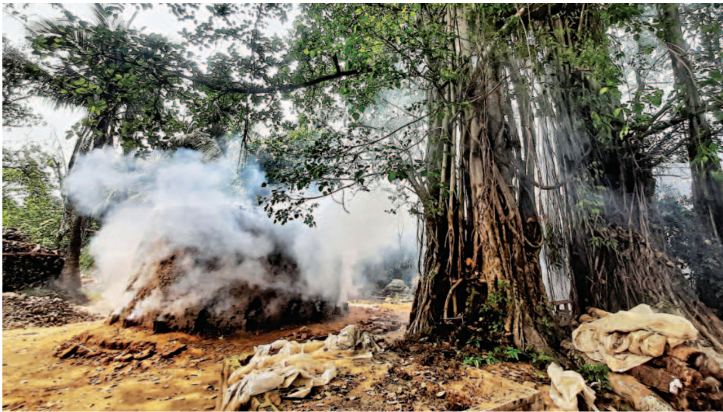
Smoke emitting from a large earthen stove in which bricks are being burned in the Chenchuri area of Khulna's Dumuria upazila yesterday. At least 12,000 bricks are burned every day in one of these stoves and the process requires almost 100 maunds of wood. The whole process lasts at least 25-30 hours, with massive amounts of smoke spreading throughout the area, posing health hazards for the locals and causing harm to the environment.