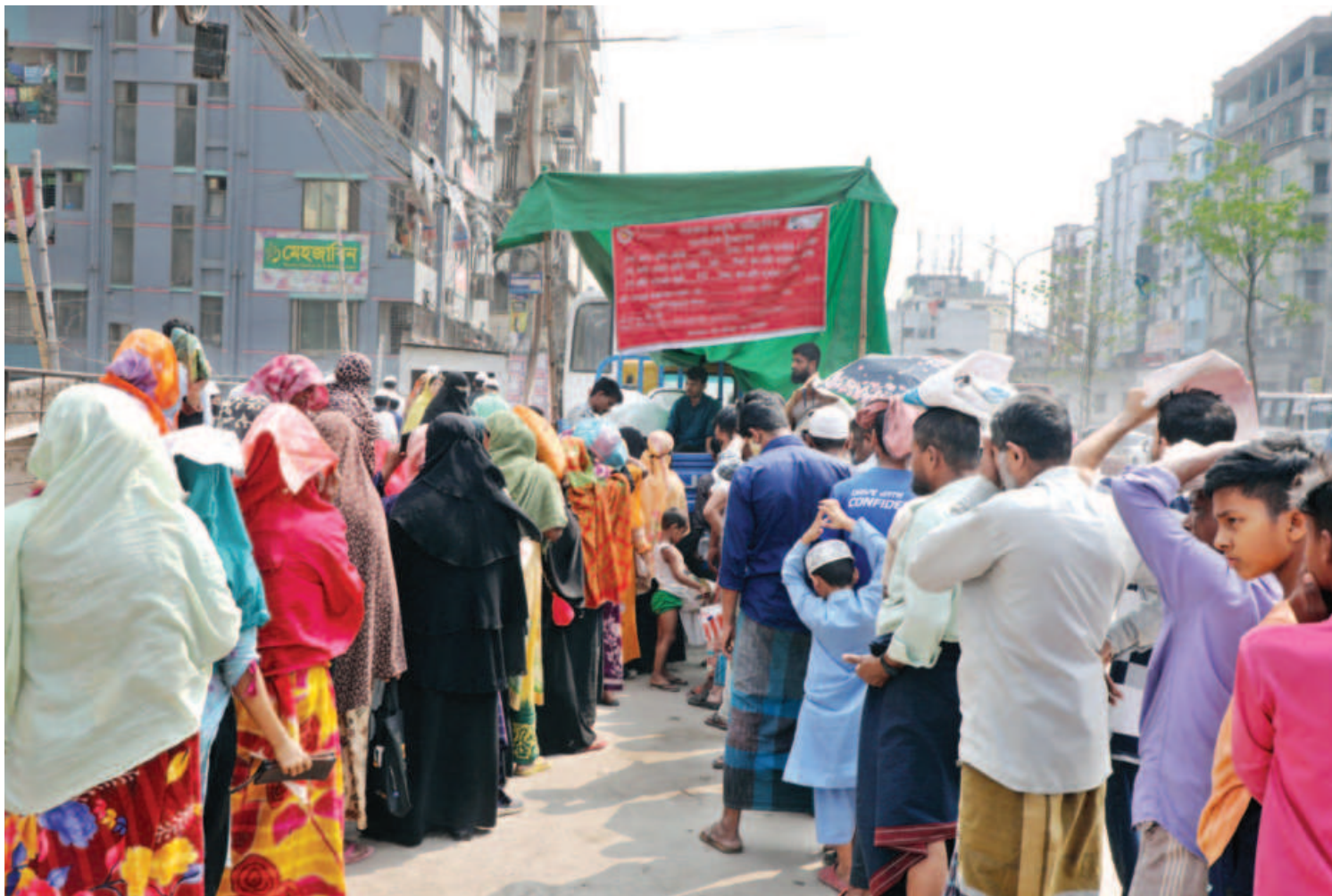
People queue up in front of an OMS truck to buy rice and flour at subsidised price at Basila in the capital's Mohammadpur yesterday. Each of them was allowed to buy five kg of rice at Tk 30 per kg and two kg of flour at Tk 24 per kg.

"In the backdrop of the soaring inflation, the National Board of Revenue should reduce the duties and taxes both at the import and domestic levels in order to provide some respite to consumers with low and limited incomes."