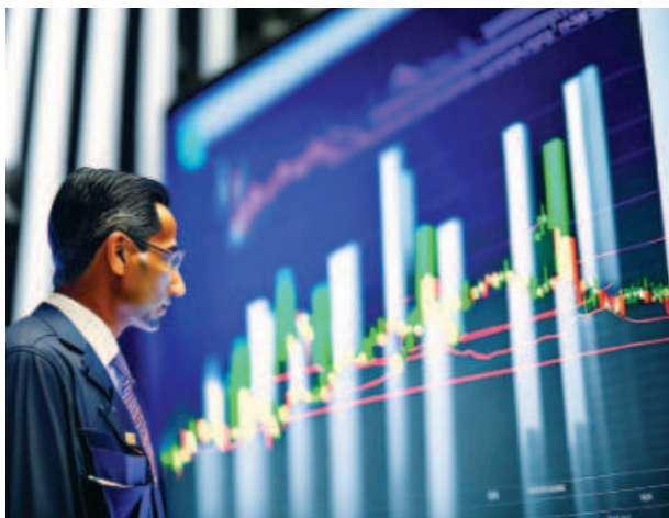
AI GENERATED IMAGE

The key index of the DSE gradually slipped after witnessing some positive vibe in the first hour of the session since investors have continued to act cautiously amid the ongoing high-inflationary environment, said International Leasing Securities Ltd in its daily market analysis.