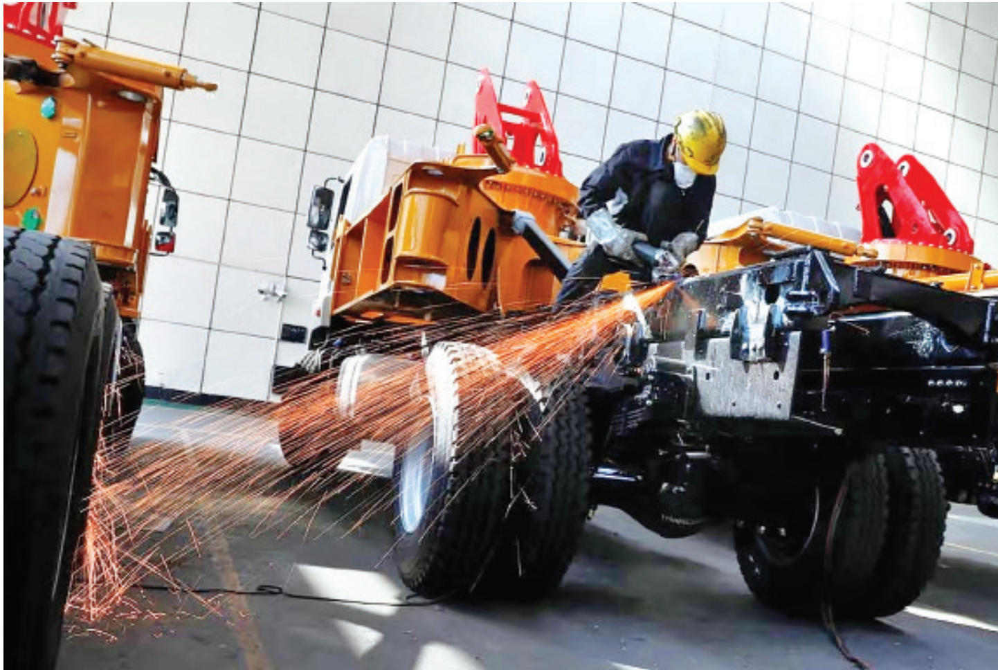
An employee works at a manufacturing plant of Sany Heavy Industry in Changsha, Hunan province. China's factory output growth accelerated to 2.4 per cent in January-February, data showed earlier this month.

Economists also slightly raised the chances of the Fed achieving a so-called "soft landing" -- bringing down inflation while avoiding a recession -- from 27 per cent in August to 30 per cent in March this year.