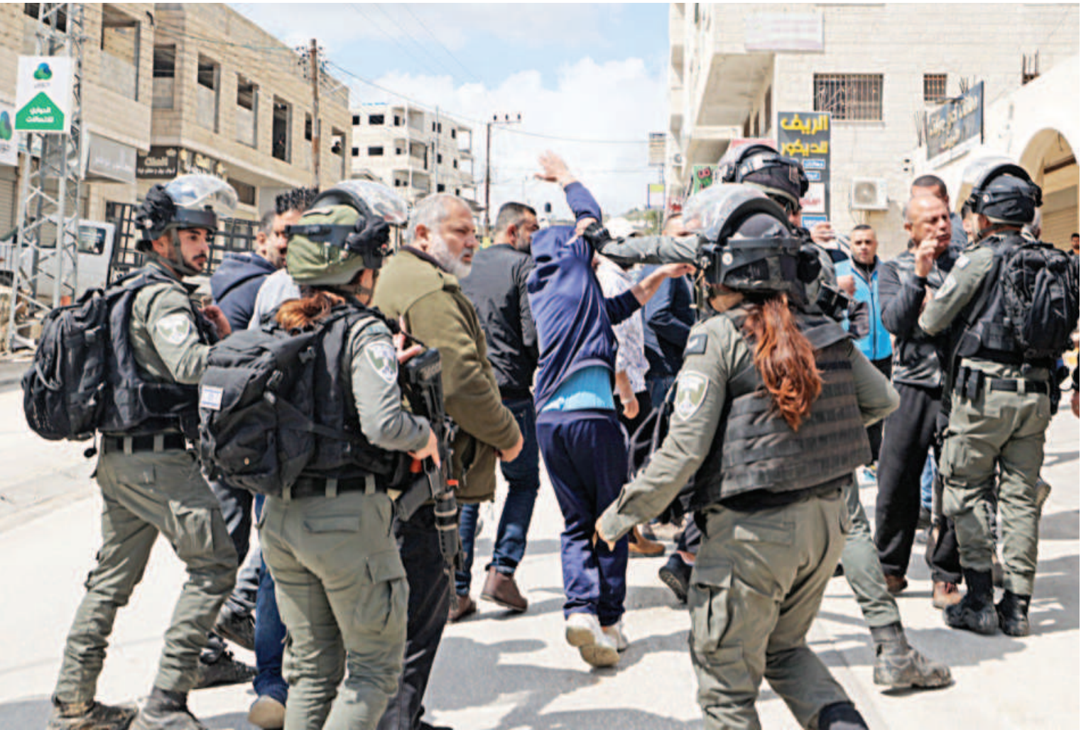
Palestinian men scuffle with Israeli security forces in the West Bank town of Huwara, yesterday. Two Israeli soldiers were wounded on Saturday, the military said, in a drive-by shooting claimed by a Palestinian armed group in Huwara.

time to rebuild his forces in Ukraine. Washington has said recently that it fears Beijing could arm Russia, something China denies. In his televised remarks, Putin dismissed suggestions that Moscow’s increased ties with Beijing in areas such as energy and finance meant that Russia was becoming overly dependent on China, saying these were the views of “jealous people”. “For decades many have desired turning China against the Soviet Union and Russia, and vice versa,” he said. “We understand the world we live in.” Putin also accused the US and Nato of seeking to build a new global “axis” that he said bore some resemblance to the WWII alliance between Germany, Italy and Japan. Putin named Australia, New Zealand and South Korea as being in line to join a “global Nato” and referenced a defence deal signed by UK and Japan earlier this year. “That is why Western analysts... are talking about the West starting to build a new axis similar to the one created in the 1930s by the fascist regimes of Germany and Italy and militarist Japan,” he said.