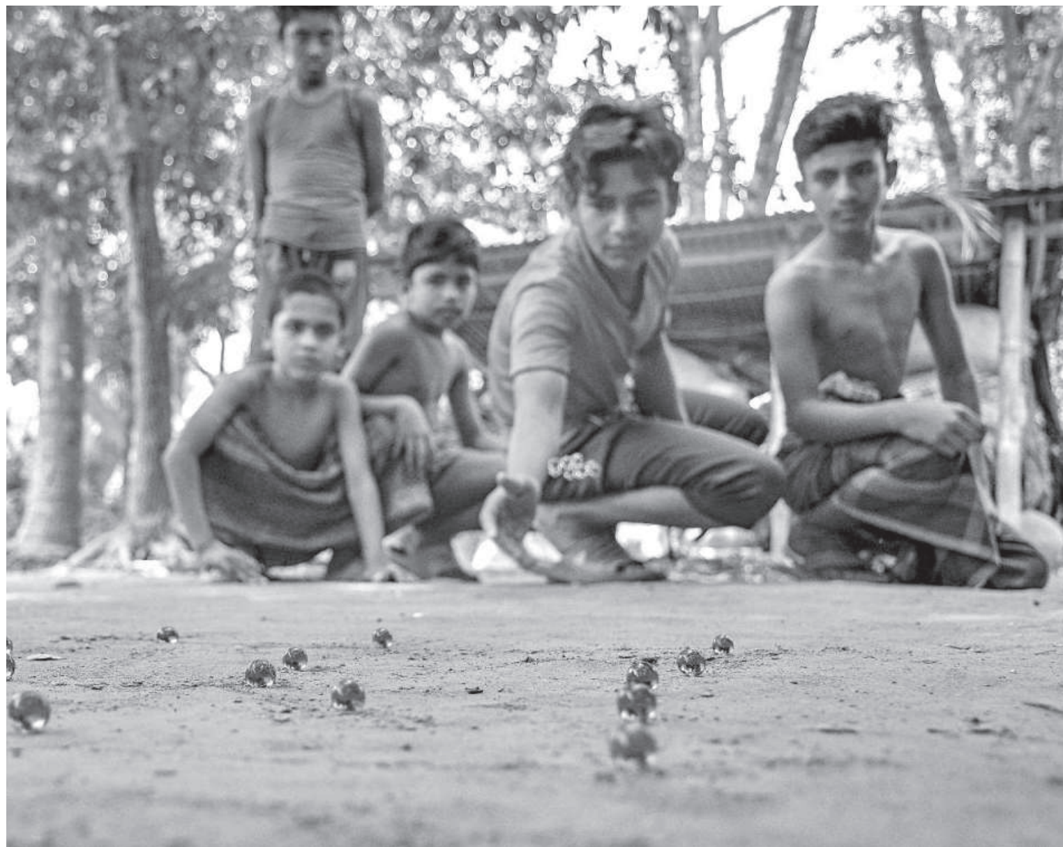
Although kids these days are mostly seen busy in front of a digital screen for entertainment, the youths of Barishal's Bashkola village prefer playing with marbles with their friends. After getting their chores and lunch done, the children gather in the yard in front of their house in the afternoon for an exciting match. This photo was taken recently.