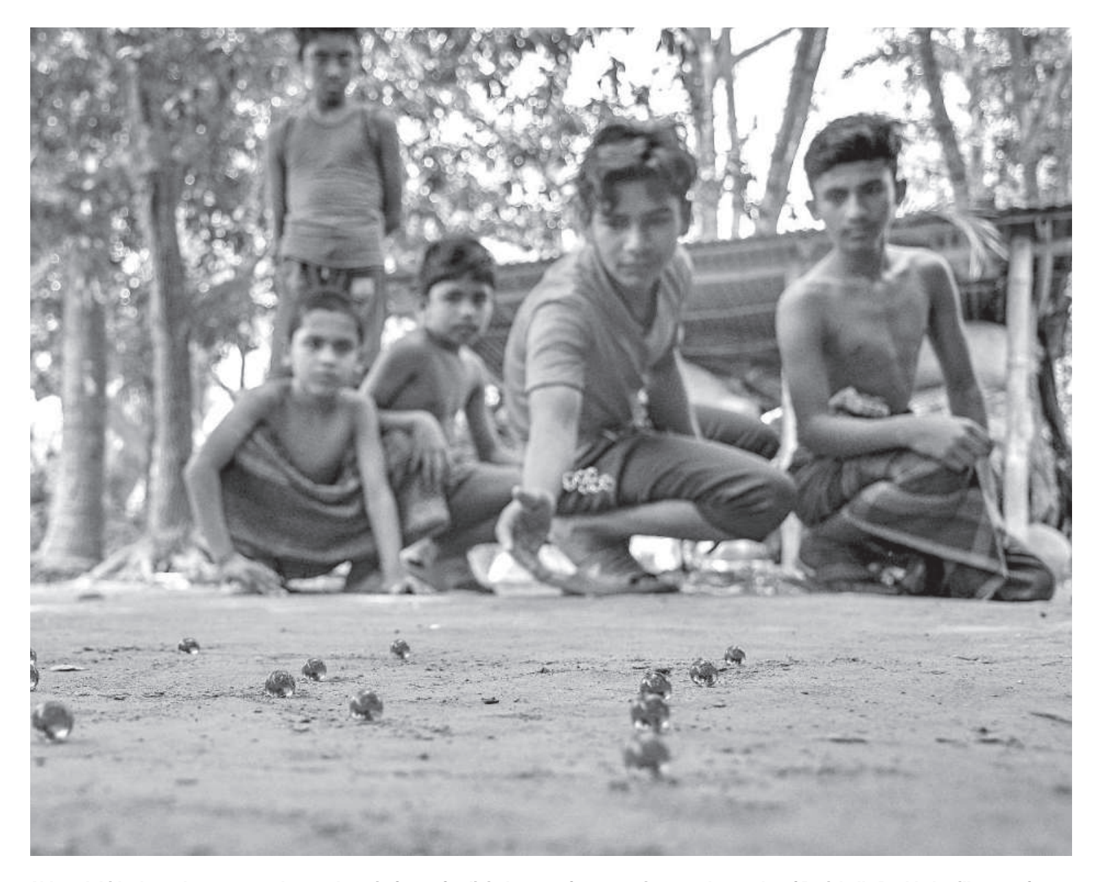
Although kids these days are mostly seen busy in front of a digital screen for entertainment, the youths of Barishal's Bashkola village prefer playing with marbles with their friends. After getting their chores and lunch done, the children gather in the yard in front of their house in the afternoon for an exciting match. This photo was taken recently.