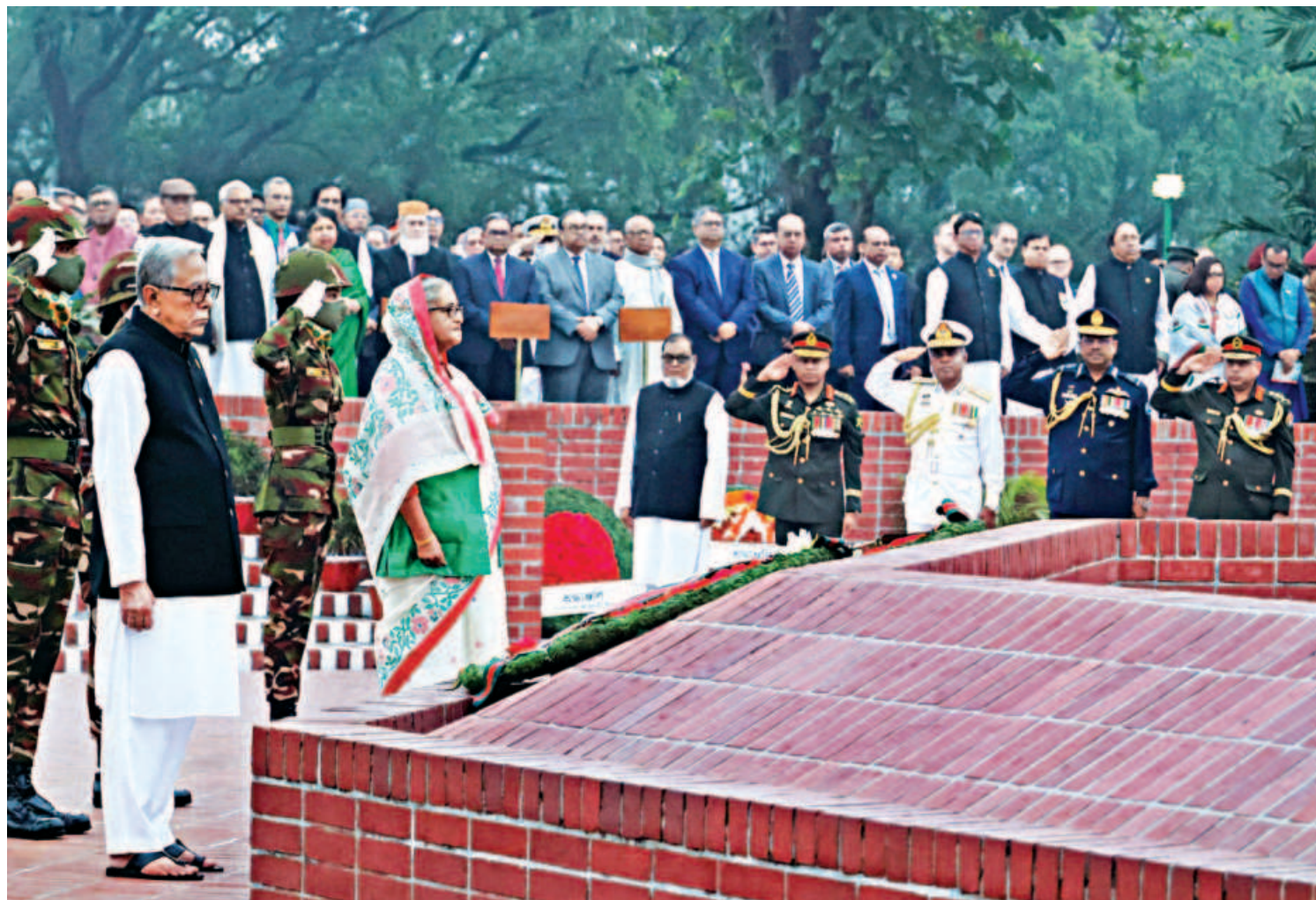
Prime Minister Sheikh Hasina and President Abdul Hamid paying tribute at the National Martyrs' Monument in Savar on Independence Day yesterday.

Ministers from other UN-member countries also spoke at the dialogue.