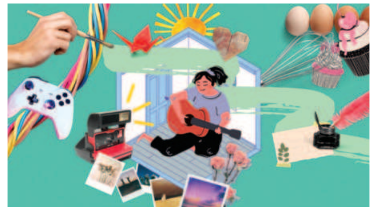
ILLUSTRATION: FATIMA JAHAN ENA

While hobbies are meant to make us feel great, sometimes they don't or we just feel like they're out of our reach. Yet, this just encourages us to try everything we haven't. We quit trying to be good