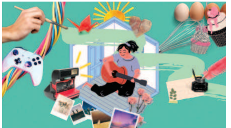
ILLUSTRATION: FATIMA JAHAN ENA

While hobbies are meant to make us feel great, sometimes they don't or we just feel like they're out of our reach. Yet, this just encourages us to try everything we haven't. We quit trying to be good