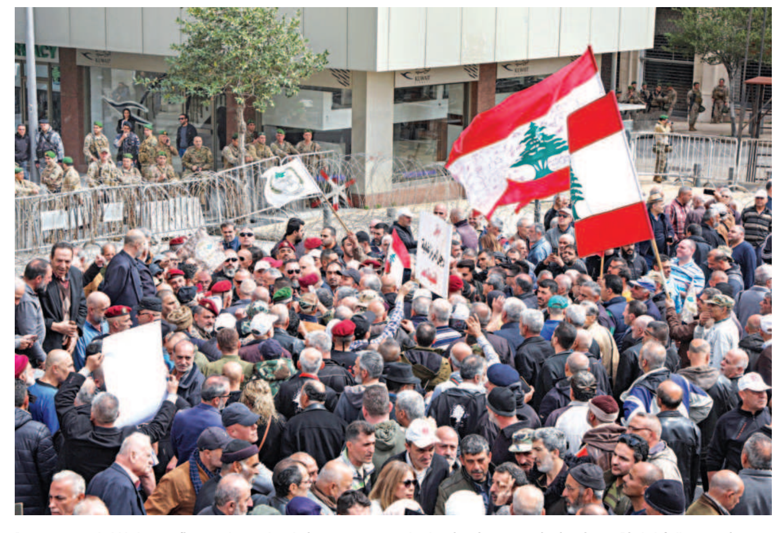
Demonstrators hold Lebanese flags as they gather during a protest over the deteriorating economic situation, at Riad al-Solh square in Beirut, Lebanon yesterday.