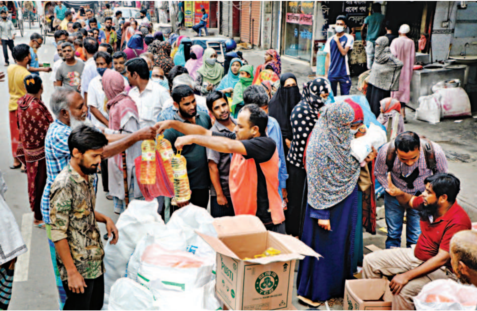
The queues in front of OMS trucks are getting longer by the day, amid soaring prices of daily essentials. With Ramadan just a few days away, along with buying regular items, people were seen purchasing pulses, grams and dates -- some of the must have items for the month of fasting and abstinence. This photo was taken in Shyamoli.