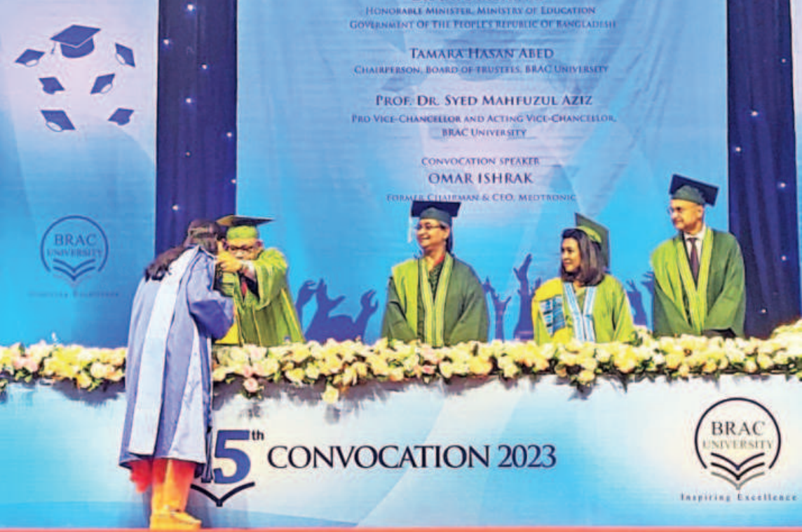
The 15th convocation of Brac University was held at Bangabandhu Bangladesh-China Friendship Exhibition Center in Dhaka yesterday. Attending as the chief guest, Education Minister Dipu Moni conferred degrees on 4,889 students.