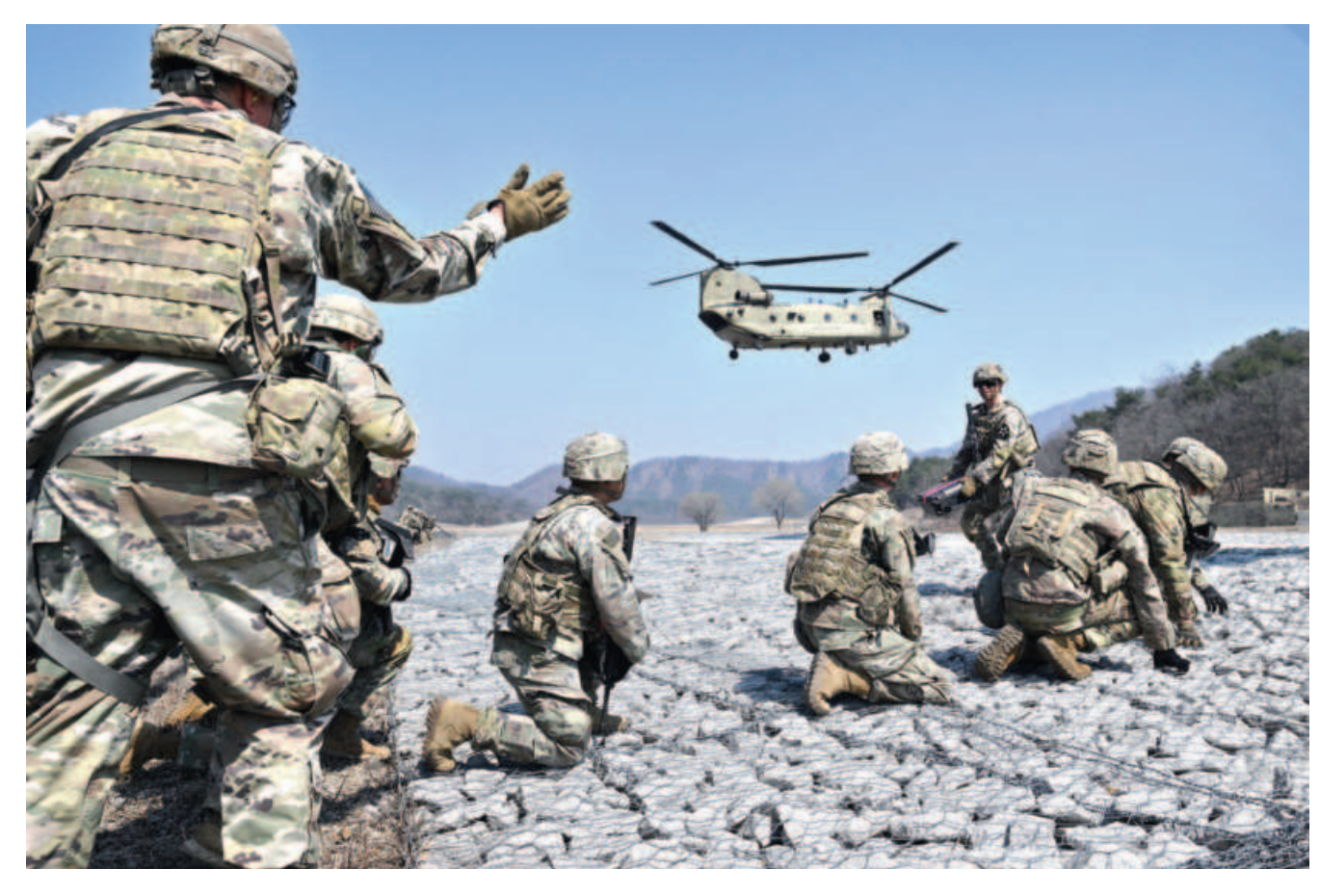
US soldiers take a position as a US Army CH-47 Chinook helicopter prepares to land during a field artillery battalion gun raid drill at a military training field in Pocheon yesterday, as part of the Freedom Shield joint military exercise. South Korea and the United States kicked off their largest drills in five years on March 13. The drills will last for 10 days.

The Palestinians aim to establish an independent state in the West Bank and Gaza Strip with East Jerusalem as its capital territories Israel captured in a 1967 war.