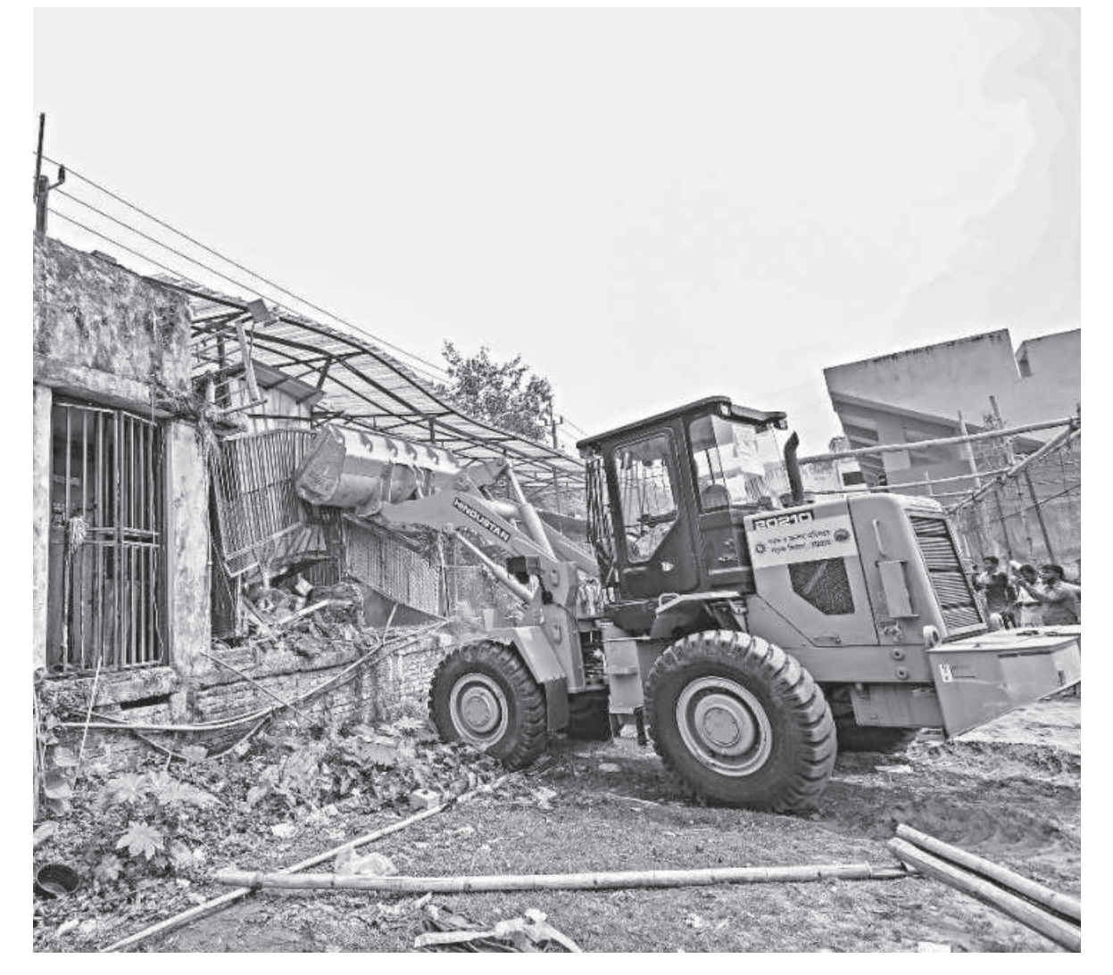
Chattogram District Administration demolished 15 establishments -- including two restaurants -- in the city's Outer Stadium area yesterday to recover the playground.