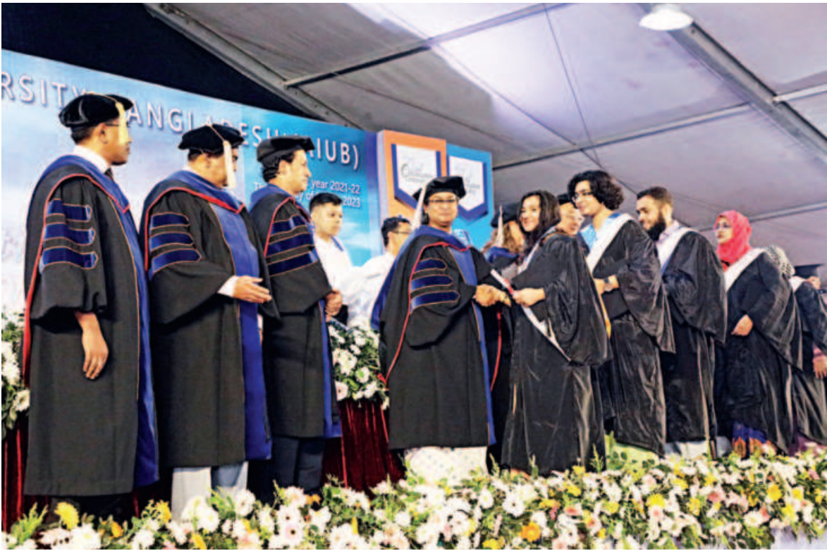
Education Minister Dipu Moni confers degree on students at the 21st convocation ceremony of American International University-Bangladesh (AIUB), held on the university campus in the capital's Kuril area yesterday.

STAFF CORRESPONDENT Education Minister Dipu Moni yesterday called for strengthening the link between academia and industries to boost research work. She made the comment while attending the 21st convocation ceremony of American International University-Bangladesh (AIUB), held on the university campus in the capital's Kuril area. Dipu Moni said, "We need to increase our collaborative efforts with national and international universities to improve in the fields of research." Attending as the chief guest, the minister conferred degrees on 4,722 graduates.