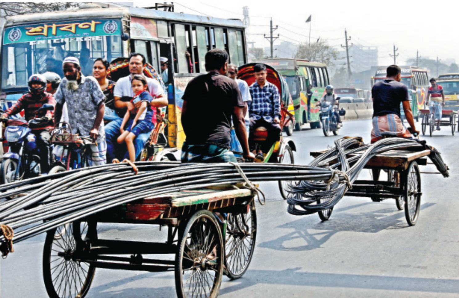
These rickshaw-vans, with metal rods jutting out from both sides, are breaking multiple laws while moving on Dhaka-Chattogram highway. Firstly, slow-moving vehicles like these are strictly prohibited from using highways. On top of that, the three-wheelers decided to go the wrong way, against oncoming traffic. Suffice to say, such disregard for the rules can result in a tragedy. This photo was taken in Narayanganj's Signboard area recently.