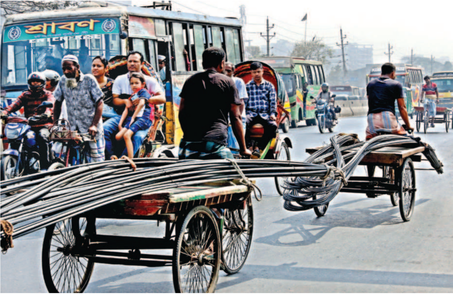
These rickshaw-vans, with metal rods jutting out from both sides, are breaking multiple laws while moving on Dhaka-Chattogram highway. Firstly, slow-moving vehicles like these are strictly prohibited from using highways. On top of that, the three-wheelers decided to go the wrong way, against oncoming traffic. Suffice to say, such disregard for the rules can result in a tragedy. This photo was taken in Narayanganj's Signboard area recently.