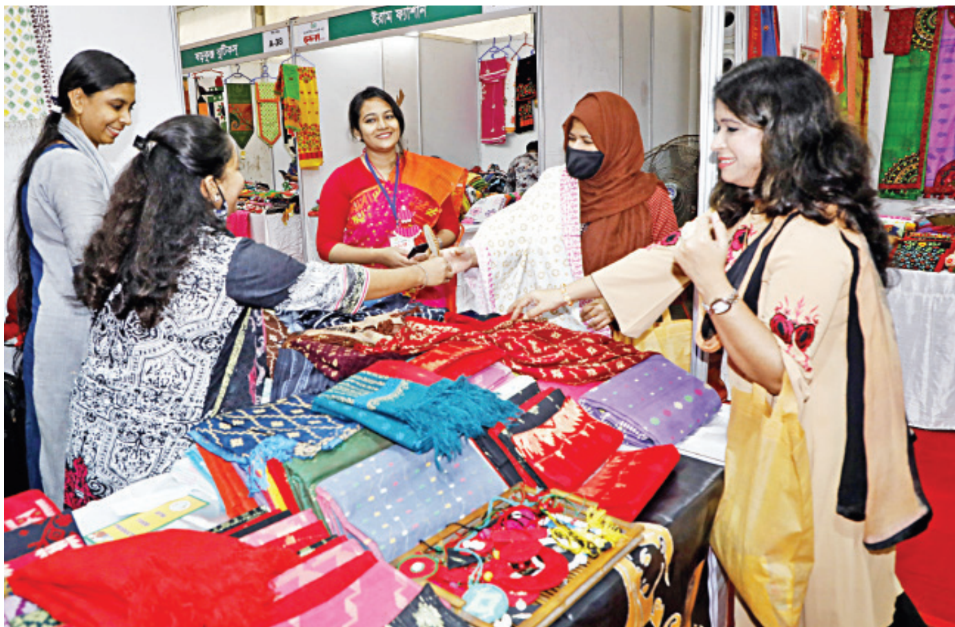
The SME Foundation in partnership with the International Trade Centre has opened the hub, which will help women entrepreneurs tackle the obstacles they experience while accessing economic opportunities.

"The sudden tightening in financial conditions won't help palladium, whose usage is largely industrial though it is technically in the precious complex," Wong said, adding that platinum "has just been a chronic underperformer and is struggling to shake its reputation".