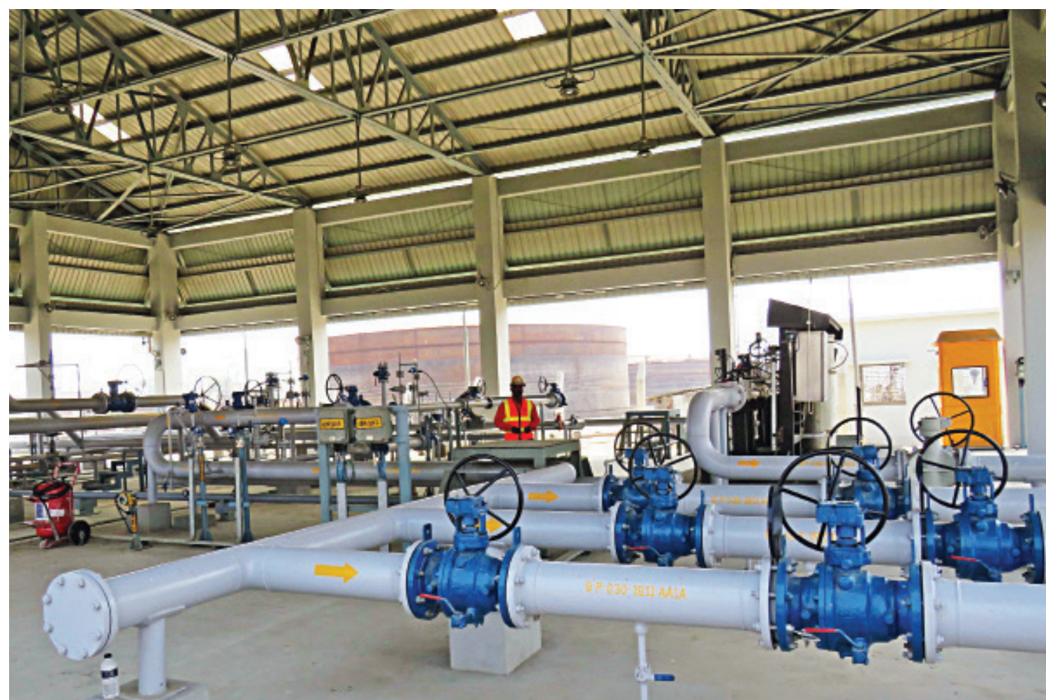
This photo shows the receiving terminal of the India-Bangladesh Friendship Pipeline in Dinajpur's Parbatipur upazila. The project will be inaugurated by Prime Minister Sheikh Hasina and her Indian counterpart Narendra Modi today.