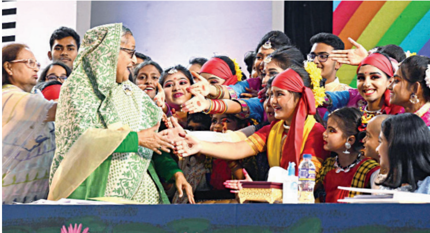
Prime Minister Sheikh Hasina interacts with children at a function organised yesterday at Bangabandhu's mausoleum in Gopalganj's Tungipara on the occasion of the 103rd birth anniversary of Father of the Nation Bangabandhu Sheikh Mujibur Rahman and the National Children's Day.