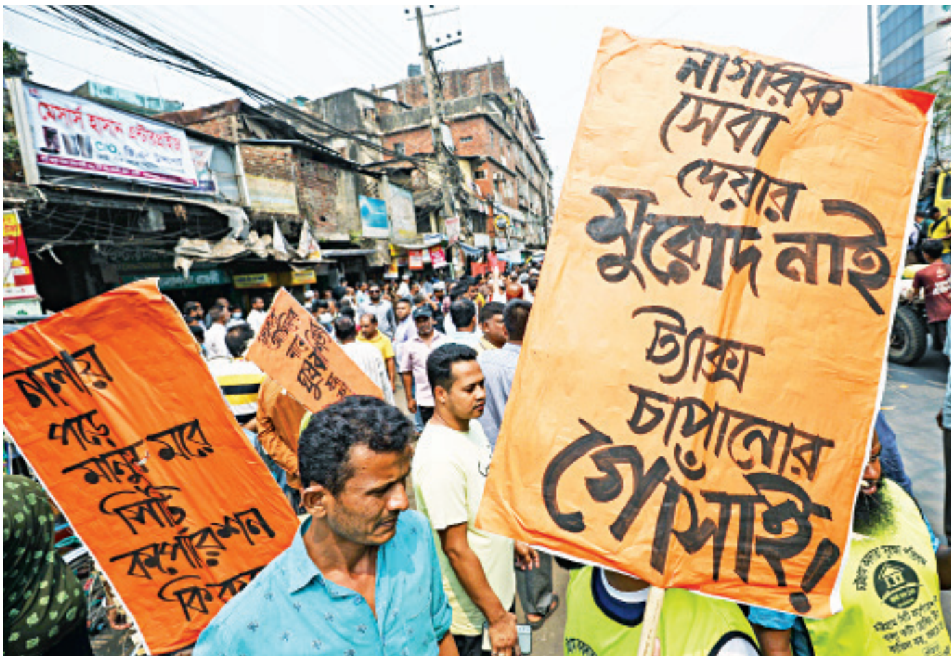
Agitating city dwellers in Chattogram protesting in Kadamtali area demanding cancellation of a recent hike in holding tax yesterday. Story on page 5.