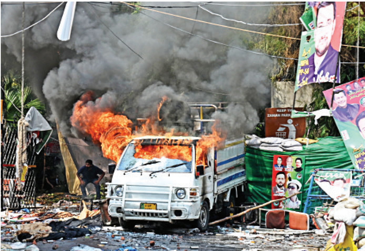
A supporter, left, of former prime minister Imran Khan stands near a burning vehicle during clashes with riot police near the Khan's house to prevent officers from arresting him, in Lahore, Pakistan yesterday.