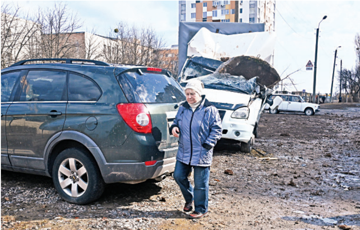
A woman walks past a damaged vehicle after a Russian missile strike in the city of Kharkiv yesterday, amid the Russian invasion of Ukraine.