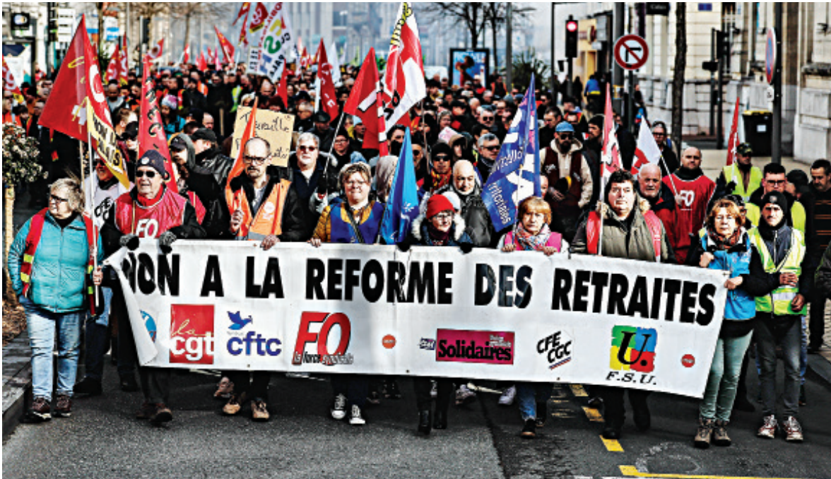
French protesters carry a banner that reads “No to the pension reform” during a demonstration on the 8th day of strikes and protests across the country against the government's proposed pensions overhaul in Calais, France yesterday.

REUTERS, Dubai Hunger and malnutrition are rising sharply in Syria and more than half its population is short of food after 12 years of war, economic pressures and last month's earthquake, the World Food Program said yesterday. "The situation is worse than ever in Syria, the United Nations agency's Middle East director, Corrine Fleischer, told Reuters. About 55 percent of Syria's population of some 12.1 million people are food insecure and a further 2.9 million are at risk of sliding into hunger, a WFP report said. Data show malnutrition is rising and that stunting and maternal malnutrition rates are at unprecedented levels. "We're very, very concerned that hunger is on a steep rise in Syria," Fleischer said. An earthquake in February which killed at least 53,000 across Syria and Turkey came on top of social and economic hardship of 12 years of war and a weakening Syrian pound. As agencies responded to the earthquake, the head of the WFP a month ago called on authorities in northwestern Syria, which is controlled by insurgents at war with forces loyal to President Assad, to stop blocking access to the area.