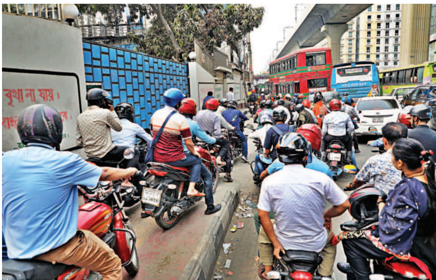
Trying to skirt around heavy traffic on the road, motorcyclists occupy an entire footpath in the capital's Banglamotor area yesterday, barring pedestrians from using it at all. The photo was taken yesterday.