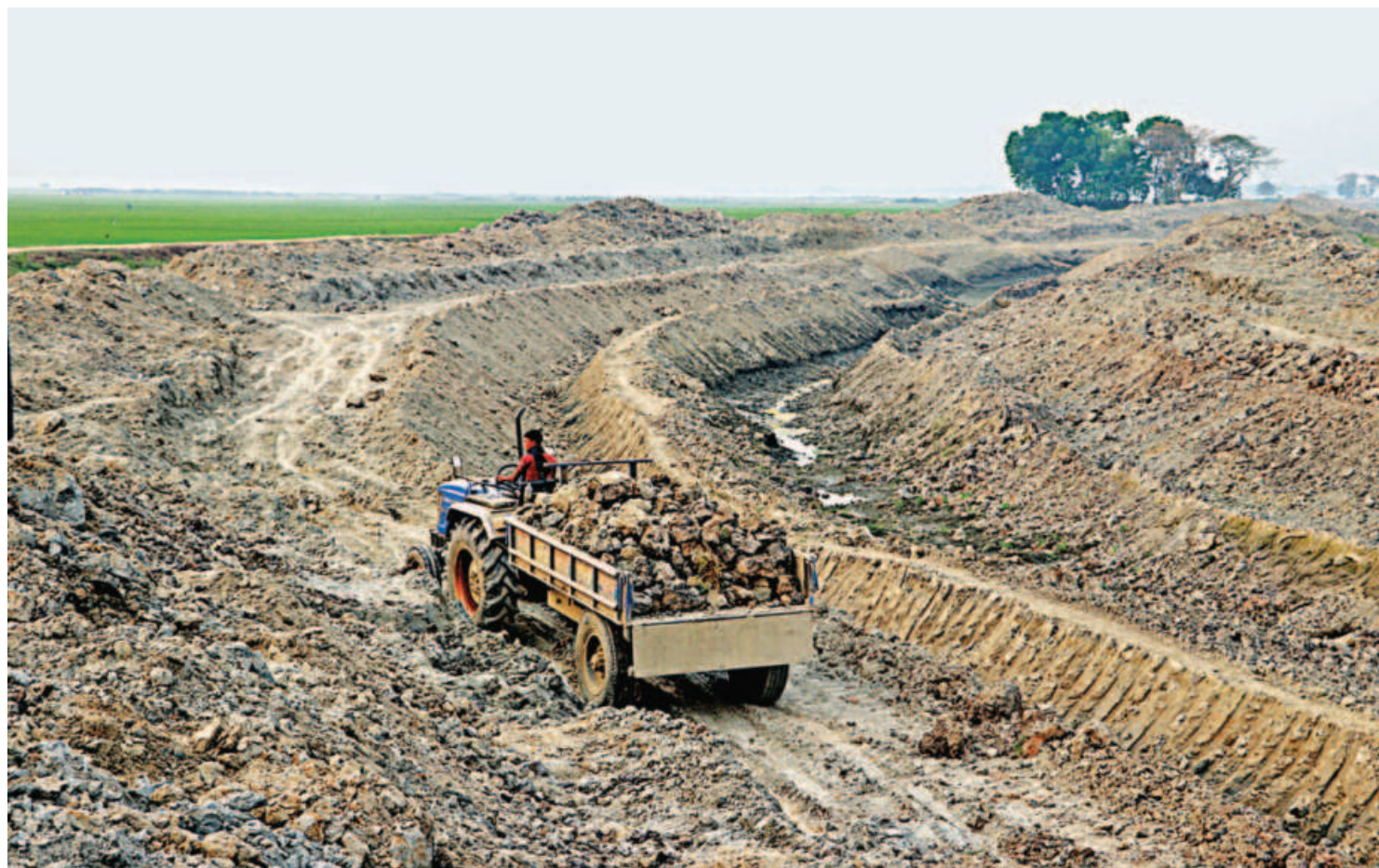
A truck carries away soil dug out from Nurpur canal in Brahmanbaria's Akhaura upazila. A contractor of Bangladesh Water Development Board is re-excavating the canal, but a huge amount of soil, supposed to be piled up along the banks, is being illegally sold allegedly by some local Awami League leaders. The photo was taken on Saturday.