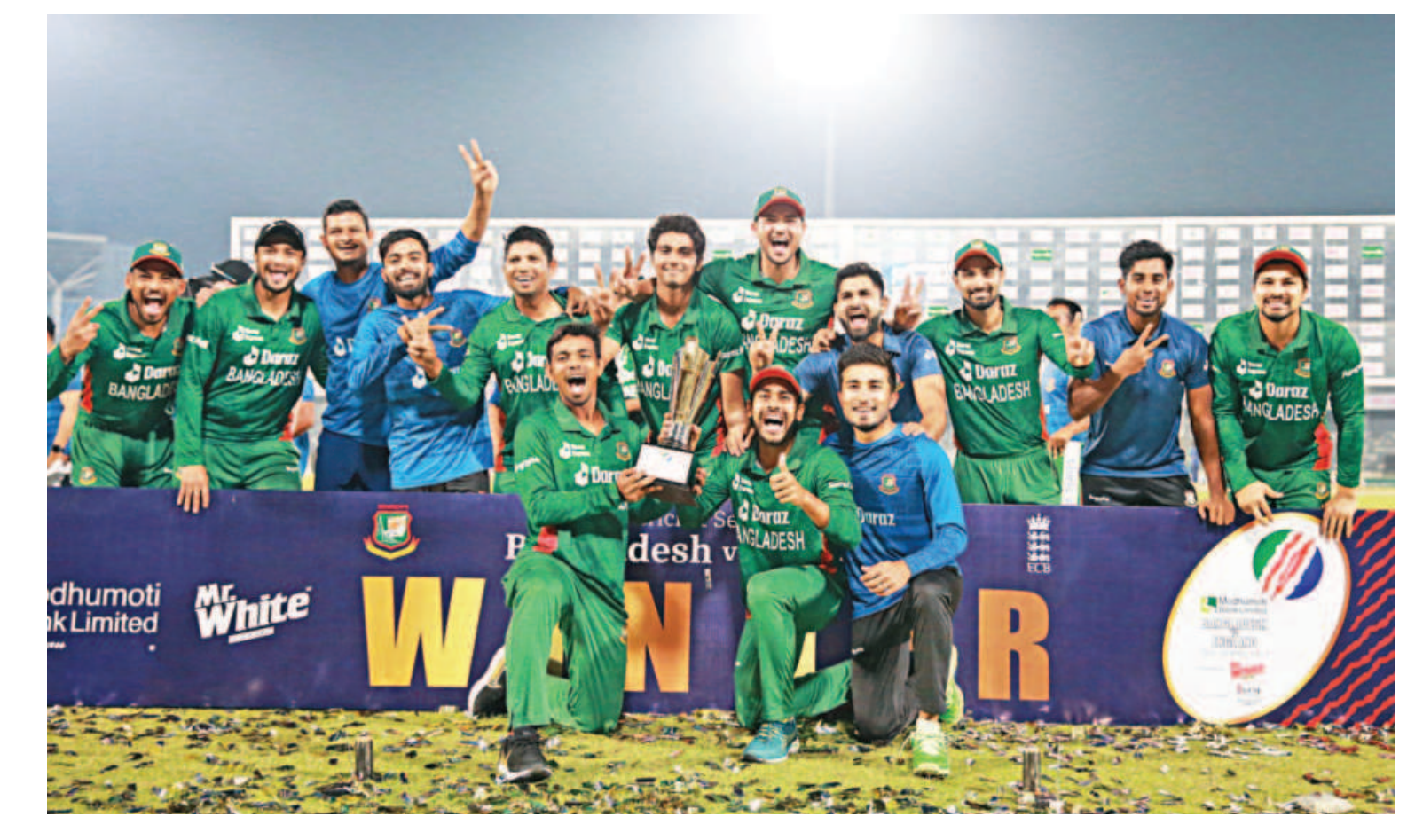
Bangladesh players celebrate with the trophy after inflicting a 3-0 series whitewash on world champions England following a 16-run victory in the third T20I at the Sher-e-Bangla National Stadium in Mirpur yesterday.