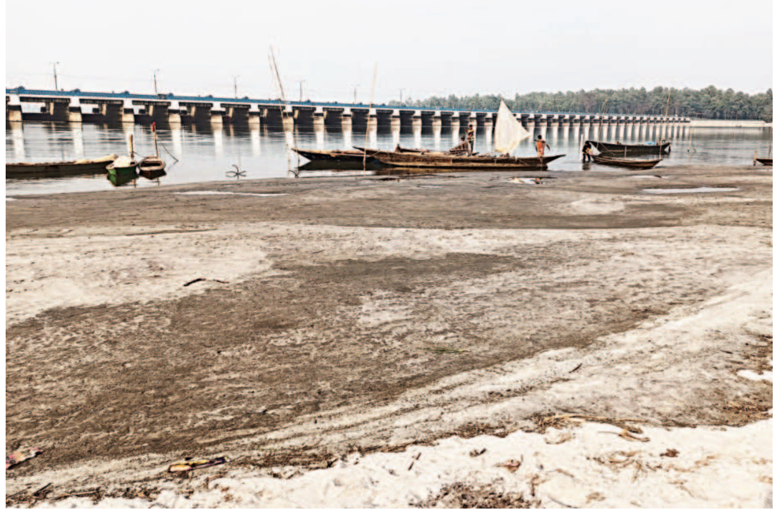
Sandy chars have emerged on the Teesta riverbed as water levels have gone down at the Teesta barrage in Dowani area of Lalmonirhat's Hatibandha upazila. The photo was taken yesterday.