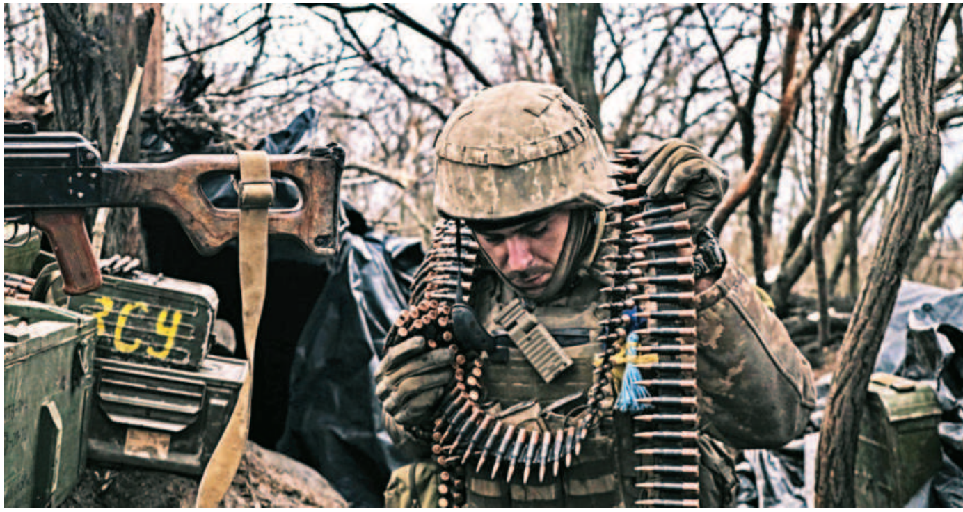
A soldier of the Ukrainian Volunteer Army prepares ammunition to fire at Russian front line positions near Bakhmut, Donetsk region, on Saturday, amid the Russian invasion of Ukraine.

"I had no right to overturn the election. ... And I know that history will hold Donald Trump accountable," Pence was quoted as saying by multiple media outlets.