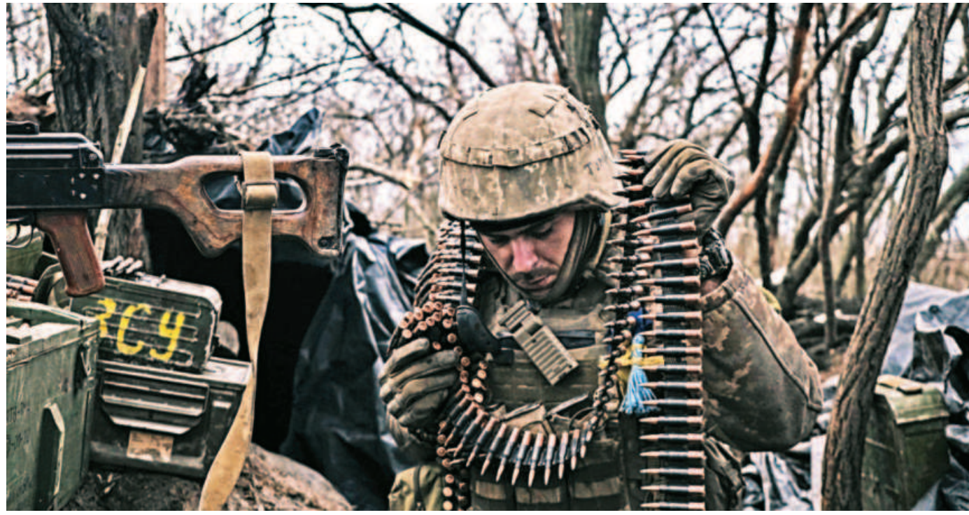
A soldier of the Ukrainian Volunteer Army prepares ammunition to fire at Russian front line positions near Bakhmut, Donetsk region, on Saturday, amid the Russian invasion of Ukraine.

"I had no right to overturn the election. ... And I know that history will hold Donald Trump accountable," Pence was quoted as saying by multiple media outlets.