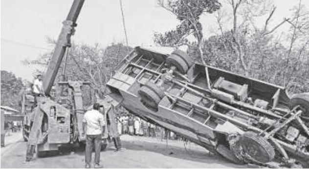
Two persons were killed and 15 injured after this passenger bus overturned in Rangpur's Gangachara upazila yesterday.