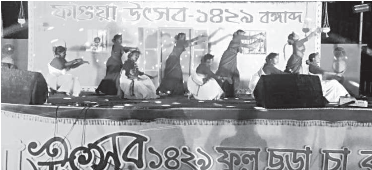
Tea workers from different areas, belonging to different ethnic groups with their own language and culture, gathered to celebrate Fagua, a festival of colours. The event showcased at least 30 mesmerising performances from different cultures, including Patrasaora, Nrityayogi, Charaiya Nritya, and more. This photo was taken from Moulvibazar yesterday.