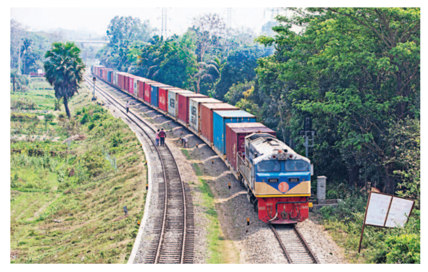
Bangladesh Railway currently provides 16 engines for shipping goods between the Chattogram port and Kamalapur Inland Container Depot in Dhaka. Only nine or 10 were used in the January-February period this year. In 2021 and 2022, these trains ran 185 round trips on an average each month. It fell to 135 and 121 respectively in January and February this year.

The deal signed for the council on October 31 last year will also improve the investors' capacity and omit all the barriers the businesses face in case of making new investments, he said.