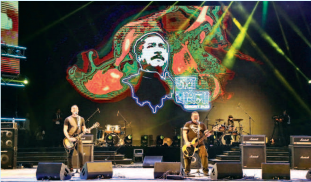
Joy Bangla Concert made a comeback after a two-year hiatus with performances from bands like Karnival, Meghdol, Lalon, Chirkutt, Cryptic Fate and Artcell. The standout rendition was Cryptic Fate's interpretation of "Teer Hara Ei Dheuer Shagor". The concert is usually arranged every year to commemorate the country's independence and Bangabandhu Sheikh Mujibur Rahman's historic March 7 speech.

DIPLOMATIC CORRESPONDENT Bangladesh has endorsed the US nominee Ajay Banga for the position of World Bank Group president, in the context of the long-standing friendship and cooperation between Bangladesh and the US. "Bangladesh believes that Mr Banga's vast experience would positively contribute to the works and the future of the World Bank Group," said foreign ministry in a statement yesterday. Indian-American executive Ajay Banga has been nominated by US President Joe Biden to become the new president of the World Bank. His election to the position will be a mere formality since the presidency has traditionally been held by the US. All 13 presidents of the World Bank so far have been US citizens; the only exception being Bulgarian national Kristalina Georgieva, who served as the acting president in 2019. The new president is likely to be in place by early May.