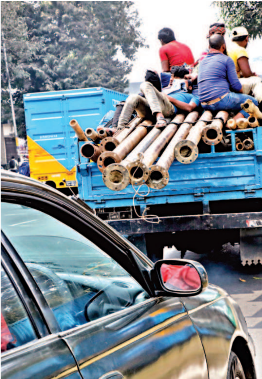
With nothing but a flimsy rope tying them together, construction materials protrude from the back of a truck. There's a private car right behind it. Due to the bumpy road, at any point, these iron rods can fall off and cause an accident. This photo was taken on Bijoy Sarani yesterday.