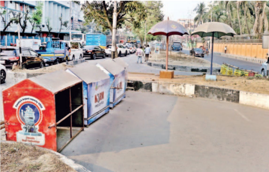
Traffic movement through this U-loop near Satrasta intersection has been restricted using barricades. Many such U-loops were constructed in the city in a bid to reduce gridlocks. However, they either have been demolished or made inaccessible due to their failure to serve the purpose. This photo was taken yesterday in Tejaon's BG press area.