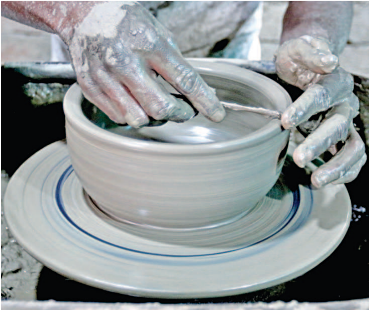
Mud lathers on the hands of a potter as he gives form to a piece of clay on a pottery wheel. Once the clay is shaped into different kinds of earthenware, workers at the pottery station put them under the sun to dry. And after many phases, these pieces of intricate craftsmanship reach the shelves of markets in the city. This particular pottery workshop in Keraniganj's Fulachar area has 20 artisans who churn out at least 3,000 pieces of earthenware each day.