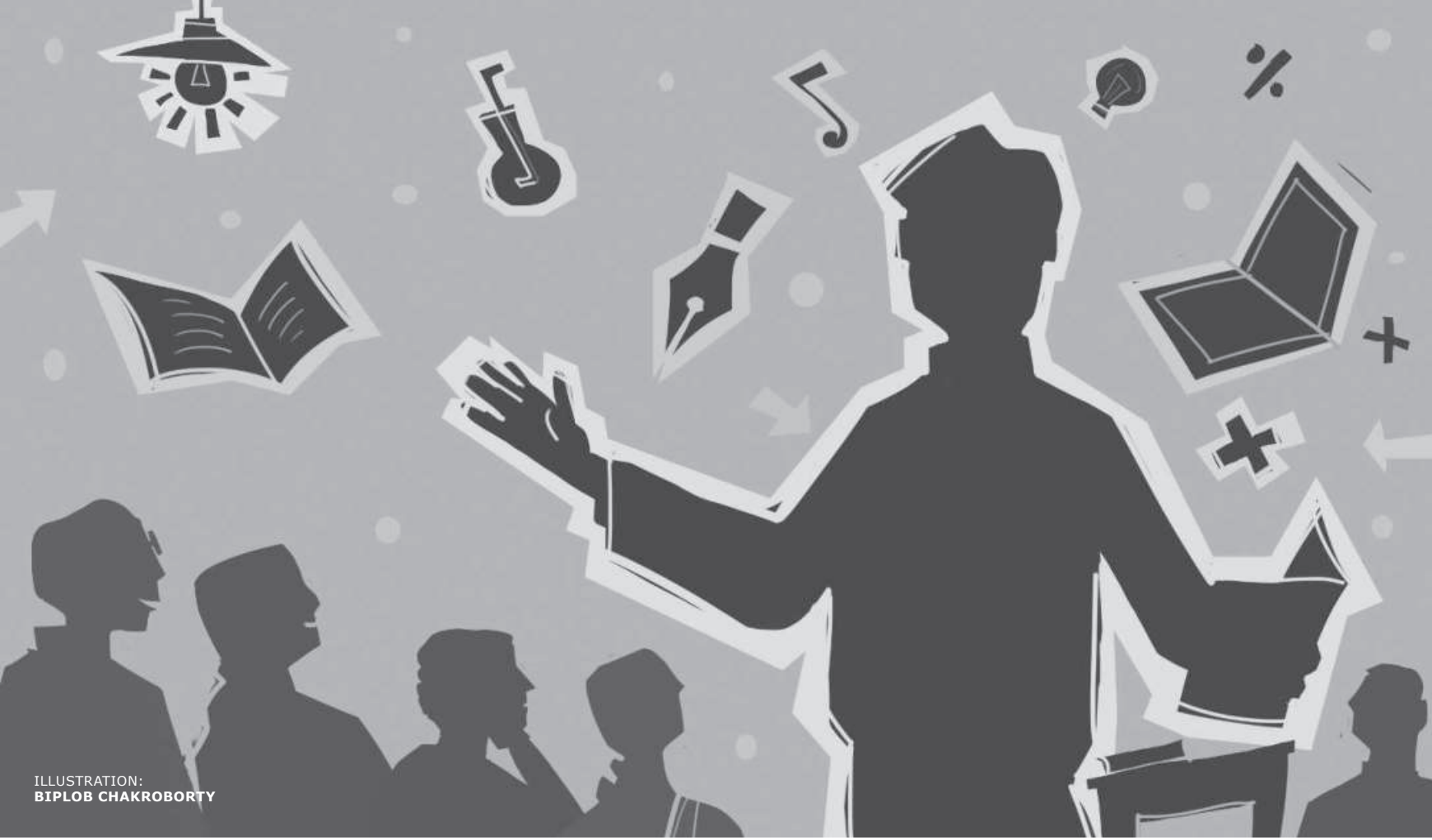
ILLUSTRATION: BIPLOB CHAKROBORTY