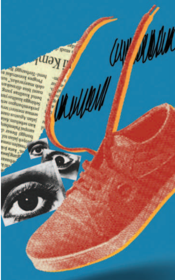
ILLUSTRATION: ABIR HOSSAIN