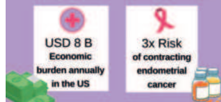
ILLUSTRATION: AAQIB HASIB