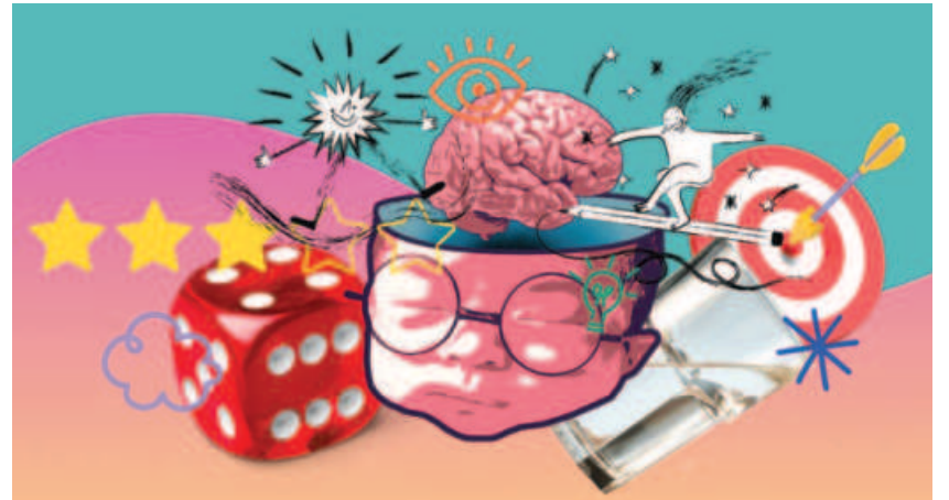
ILLUSTRATION: FATIMA JAHAN ENA