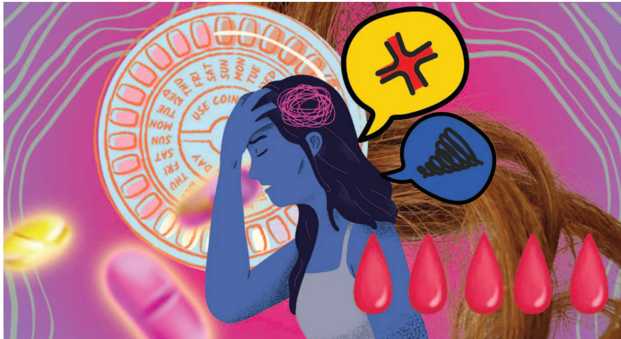
ILLUSTRATION: SYEDA AFRIN TARANNUM