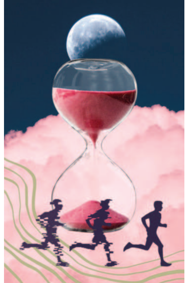
ILLUSTRATION: FATIMA JAHAN ENA