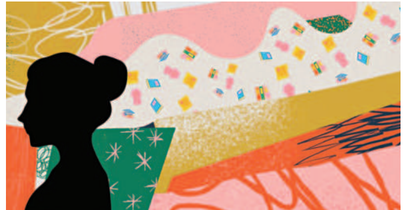
ILLUSTRATION: ABIR HOSSAIN