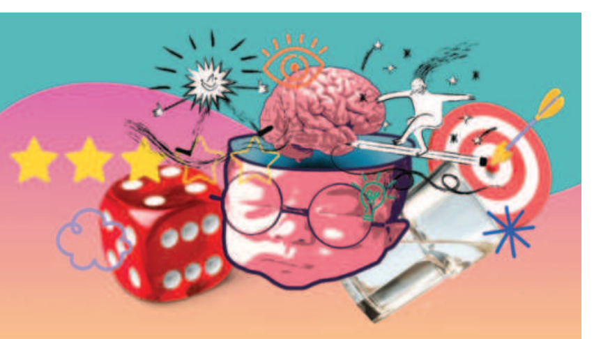
ILLUSTRATION: FATIMA JAHAN ENA