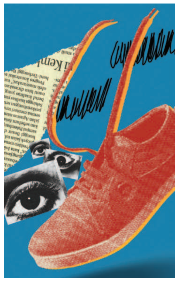
ILLUSTRATION: ABIR HOSSAIN