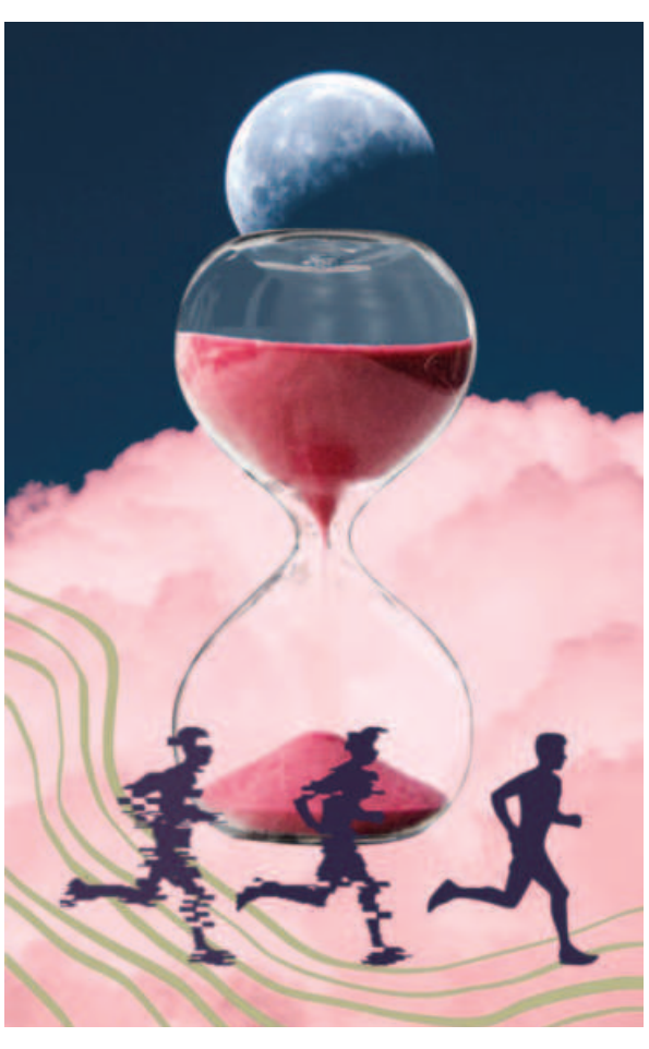
ILLUSTRATION: FATIMA JAHAN ENA