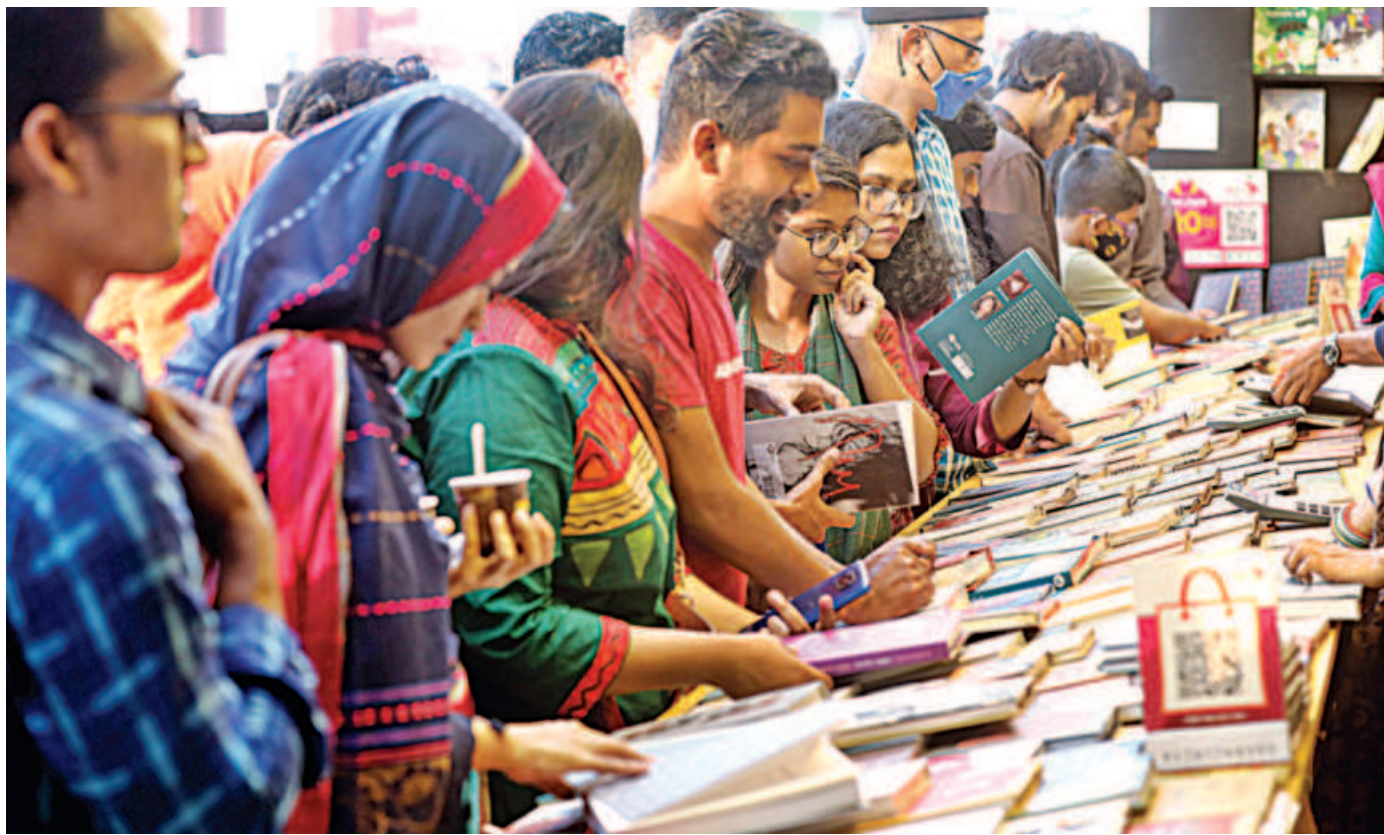
Young readers crowd the Batighor stall at the Ekushey Boi Mela in the capital's Suhrawardy Udyan yesterday -- the last day of the prestigious fair, which takes place every year throughout the month of February in honour of the language martyrs.

In the published results, 82,383 students were selected for the scholarships in two categories – talent pool and general. Of them, 33,000 students got scholarships in talent pool category and 49,383 students got in general category.