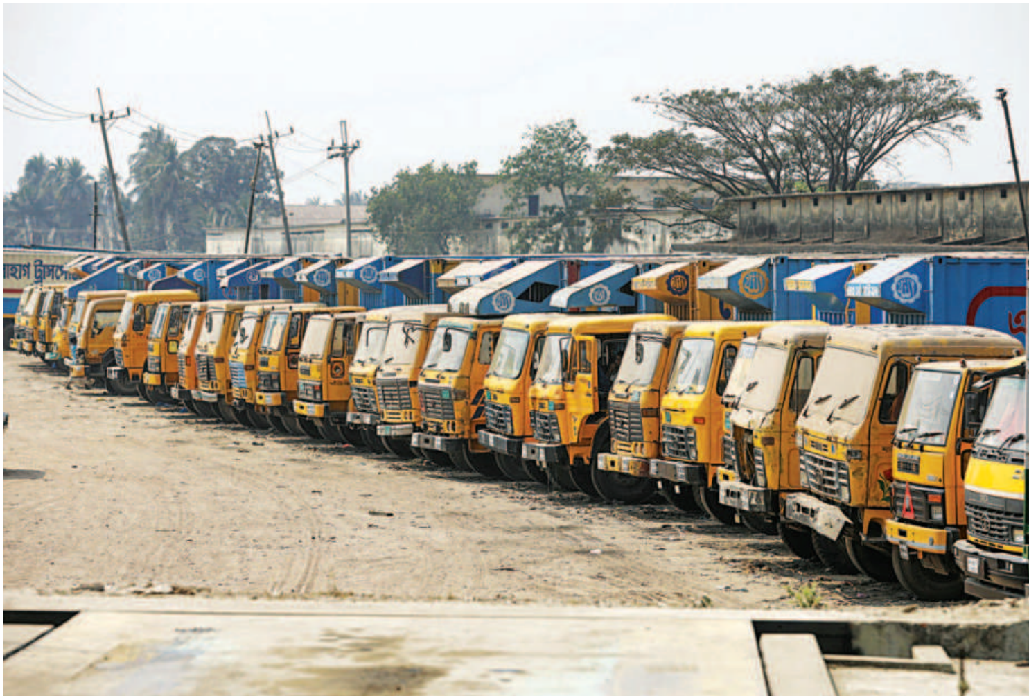
Trucks are seen parked at a terminal in the Nimtala area of the port city of Chattogram. Operators say they are not getting adequate trips to carry goods. The photo was taken on Monday.