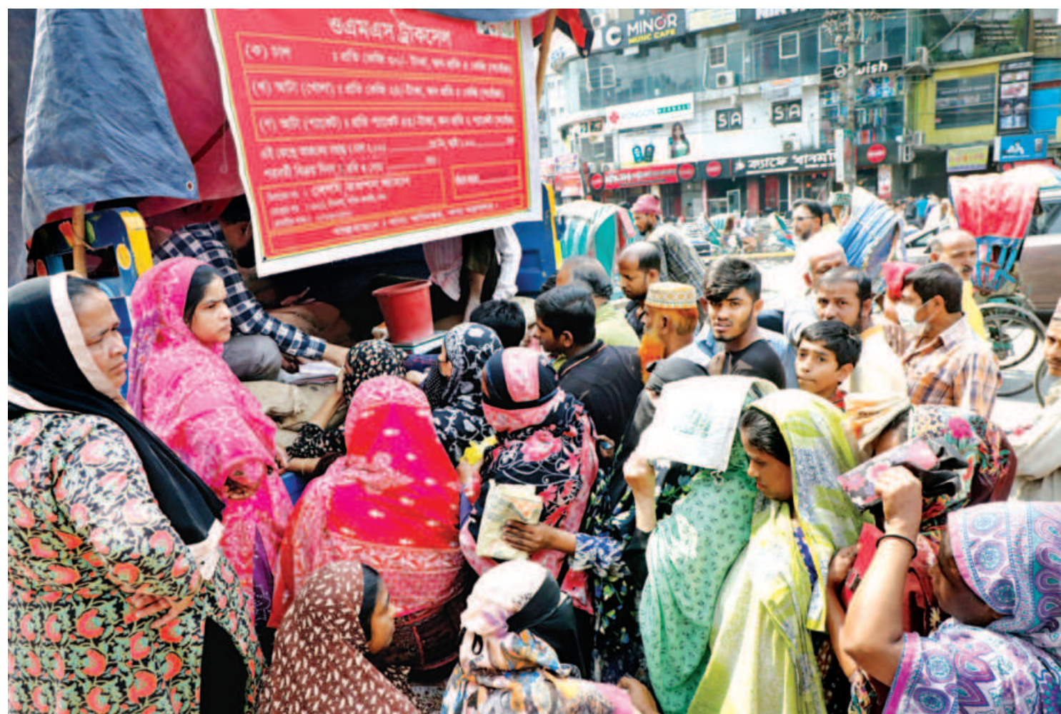
People queue up in front of an OMS truck to buy rice and flour at subsidised prices in the capital's Zigatola Bus Stop area yesterday. Each of them was allowed to buy five kgs of rice at Tk 30 per kg and five kgs of unpackaged flour at Tk 24 per kg. The buyers had to wait for about two hours.