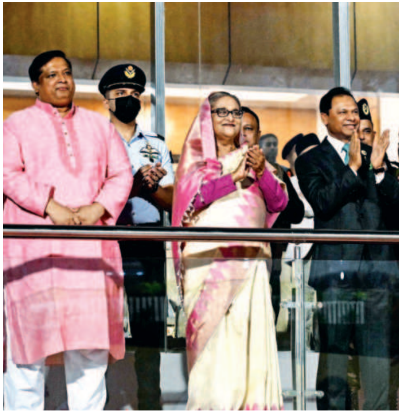
Prime Minister Sheikh Hasina, standing alongside BOA president and Army chief General SM Shafiuddin and State Minister for Youth and Sports Zahid Hasan Rassel, claps as 'Babui Pakhi', the mascot of the Sheikh Kamal 2nd Bangladesh Youth Games, passes by at the Army Stadium in Dhaka yesterday.