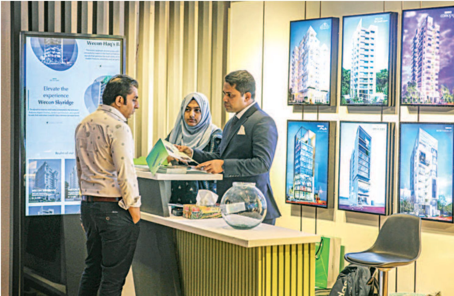
A visitor makes queries at a stall of the REHAB Chattogram Fair 2023 that ended yesterday. More than 100 units of flats and commercial spaces and some 10 plots were booked at the show.

Shares of BSC were down 5.59 per cent to Tk 125 on the Dhaka Stock Exchange yesterday.