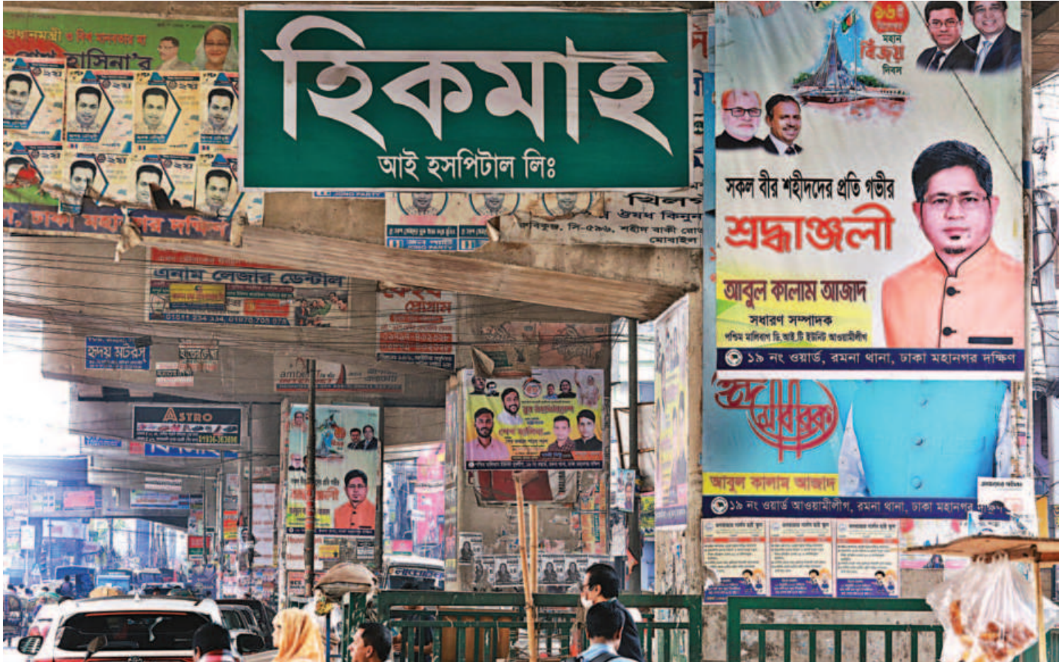
Despite a High Court order on February 6 to remove all posters and graffiti from flyovers in the capital within two weeks, the pillars and walls under the Moghbazar flyover can barely be seen as they are covered from top to bottom by political posters and banners. Poster sticking and graffiti writing were made punishable offences in a 2012 act.