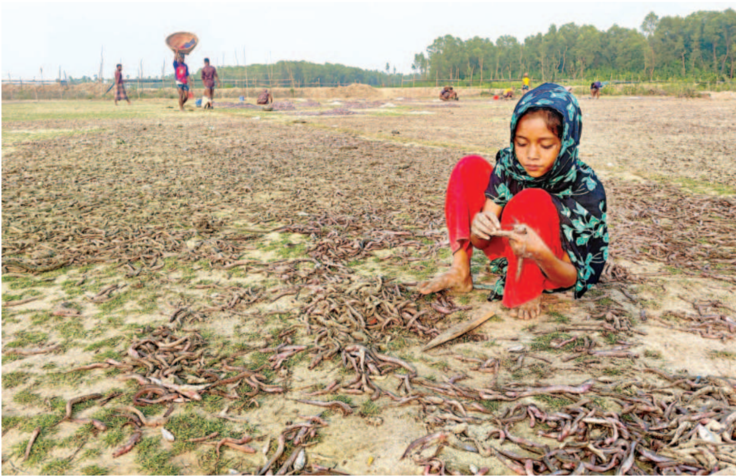
A child peeling the shells off shrimps to turn them into “shutki” (dried fish) on a small island called Dhaal Char in northern Bhola, where the Meghna meets the Bay of Bengal. School children sometimes join the adults in the work of drying the fish, even though they are not officially paid for it. On some occasions, they take a few of the fish or shrimps, and sell them to the market by themselves to earn a few hundred taka. The photo was taken yesterday.