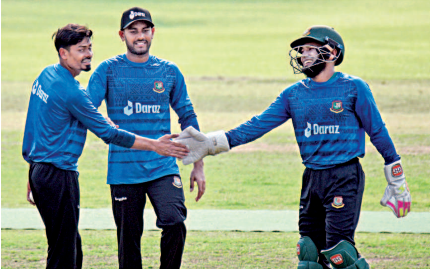
Recalled left-arm spinner Taijul Islam shakes hands with wicketkeeper-batter Mushfiqur Rahim as all-rounder Mehedi Hasan Miraz looks on during Bangladesh team's training session at the Sher-e-Bangla National Stadium in Mirpur yesterday. (Bottom) England team players chat while sitting in the lounge of the Hazrat Shahjalal International Airport upon their arrival in Dhaka earlier in the morning.

Sheikh Jamal are now sixth with 14 points, two points ahead of Mohammedan and Fortis while Rahmatganj and Azampur are in the ninth and bottom place, respectively.