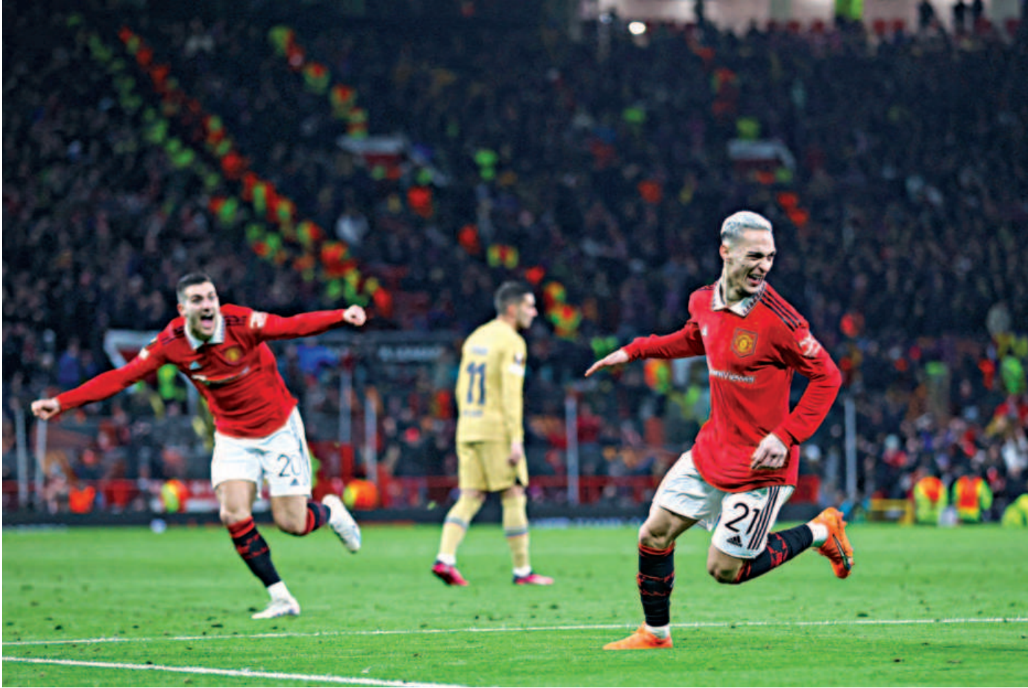
Antony scored the decisive goal to complete the comeback for Manchester United in their 2-1 win over Barcelona on Thursday to dump the Spanish side out of the Europa League, leaving the Catalans licking their wounds after another continental failure.

"If you ask him how it used to be when he was 10, 11, 12, 13, 14 -- it isn't very different. Wingers and talented players get kicked and fouled and get the demand to win games and that is the chance he has, that is his role in the team."