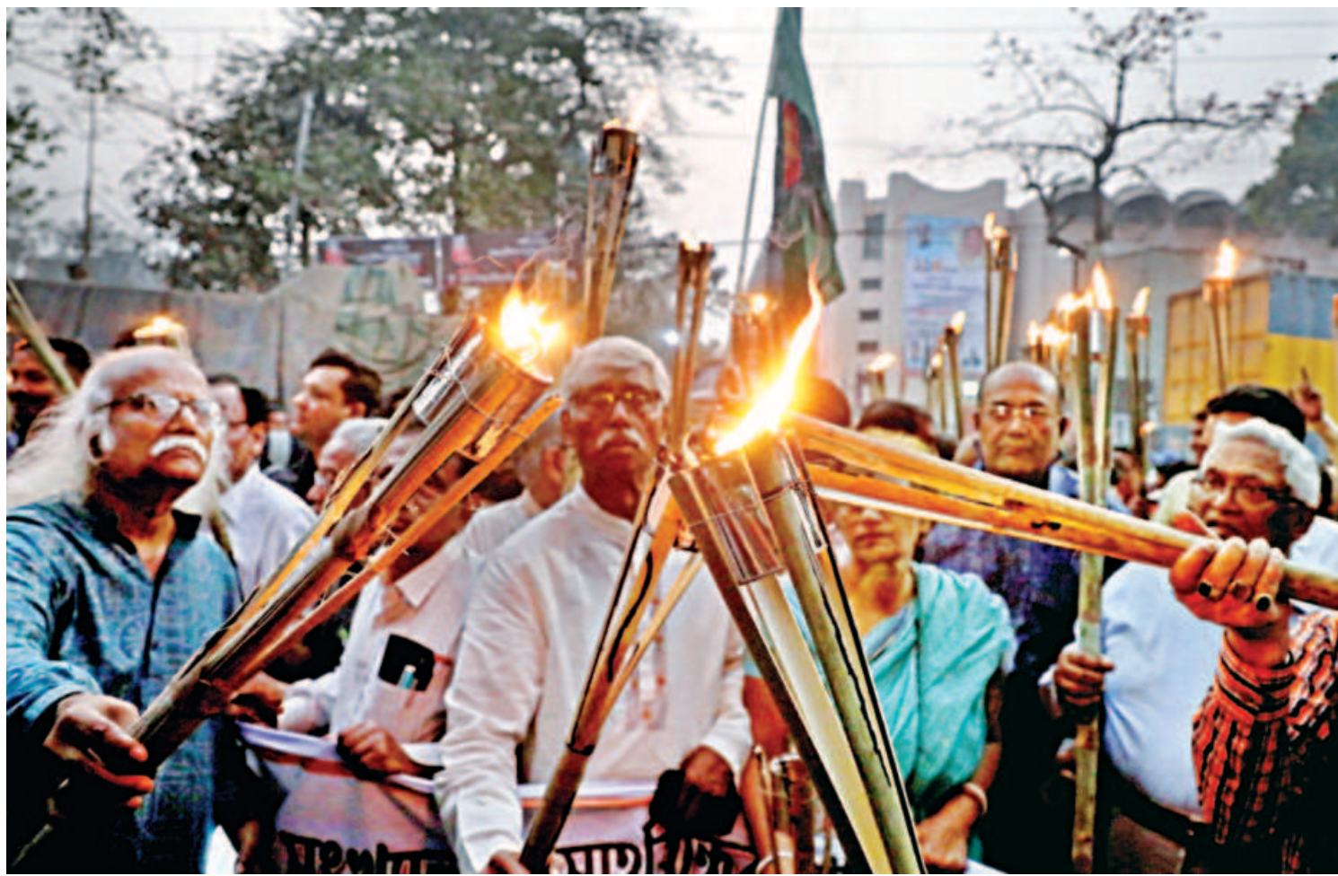
Bangladesh Hindu Buddhist Christian Oikya Parishad organised a torch procession yesterday at Shahbagh, demanding the implementation of Awami League's election manifestos that included the protection of minorities. Leaders of the organisation also mentioned that they will observe a hunger strike unto death if the demands are not met within June.