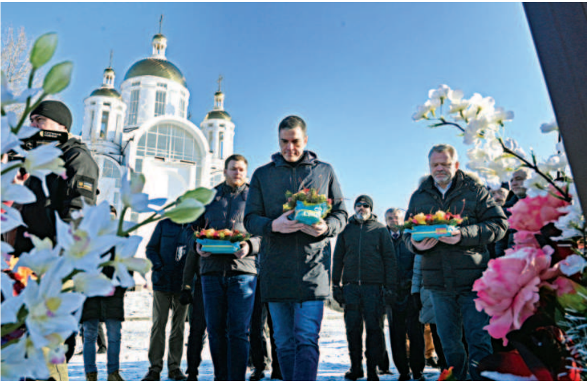
In this handout image released by La Moncloa yesterday, Spanish Prime Minister Pedro Sanchez and Mayor of Bucha Anatoliy Fedoruk leave floral tributes to the fallen, during his visit to the town of Bucha, 30km from Kyiv, in Ukraine. Pedro Sanchez arrived in Kyiv early yesterday in a show of support ahead of the one-year anniversary of Russia's invasion of Ukraine.