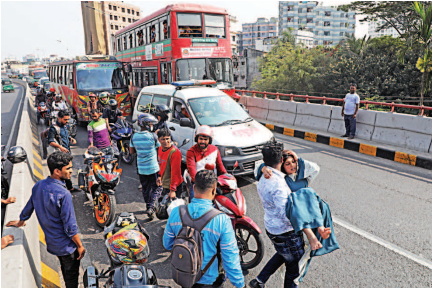
A man carries a woman towards an ambulance after she had an accident on Mayor Hanif Flyover yesterday afternoon. She fell off a motorbike while it was racing with another one on the flyover, according to witnesses. An ambulance, passing them by, stopped to take her to a hospital. Such risky and reckless driving could have easily resulted in a tragedy.