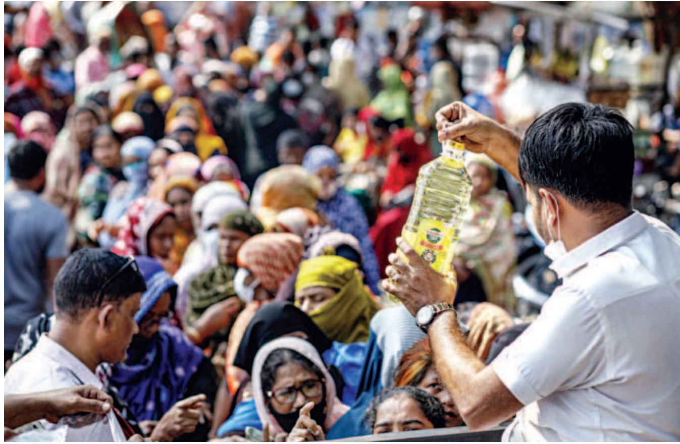
Hundreds of people stand in line to buy daily essential items, including soybean oil, at reduced prices from a TCB truck in the capital's Azimpur. People with limited income have been bearing the brunt of skyrocketing prices caused by the Russia-Ukraine war. The photo was taken a few months ago.