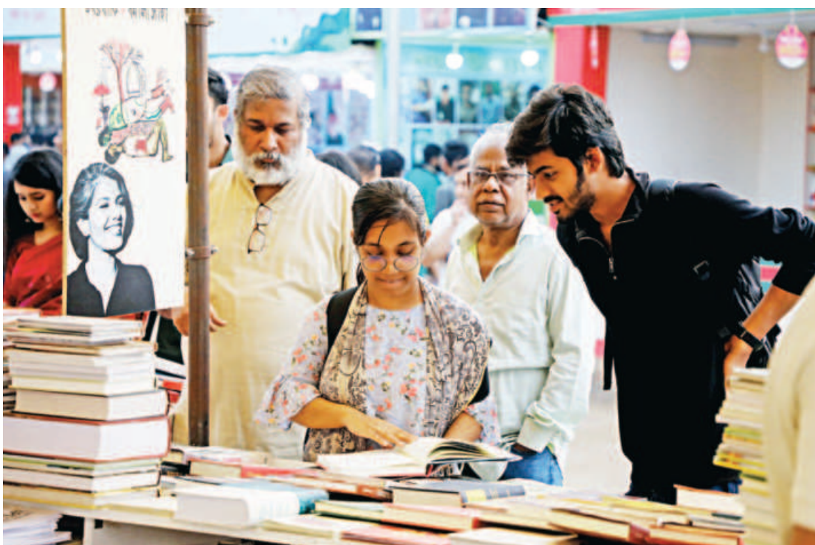
Be it browsing through books at a stall or hanging out with friends, the Ekushey Boi Mela has something for everyone. This photo of a youth engrossed in reading a book was taken at Suhrawardy Udyan. On the 23rd day of the fair yesterday, 78 new books were published, according to Bangla Academy.