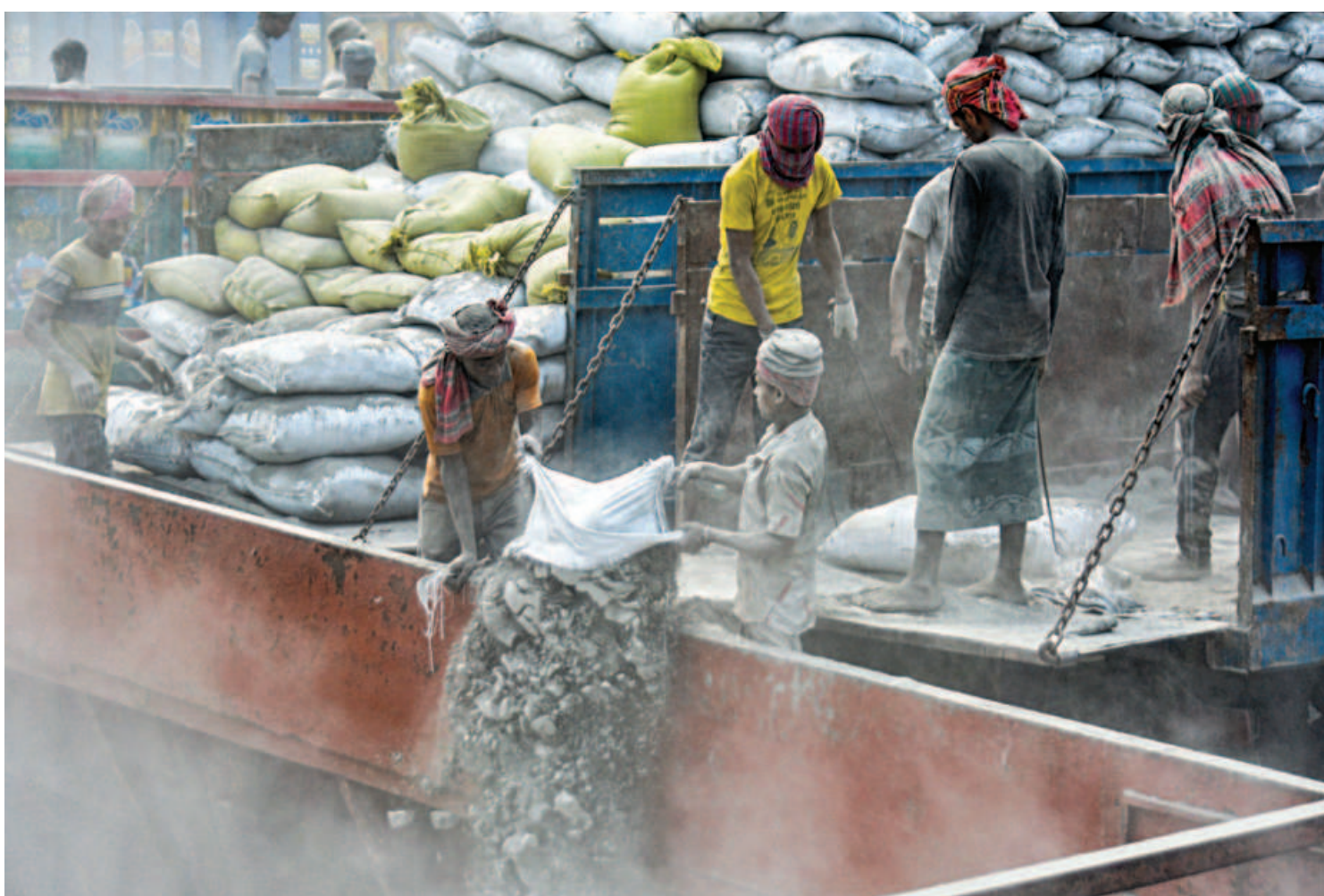
Workers loading fly ash onto a vessel from a truck in Khulna city's Launch Ghat area. Such handling of fly ash, imported from India for producing cement, exposed the labourers to health hazards and also causes air pollution. The photo was taken on Tuesday.