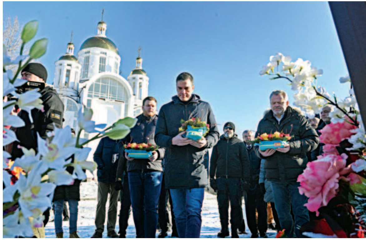
In this handout image released by La Moncloa yesterday, Spanish Prime Minister Pedro Sanchez and Mayor of Bucha Anatoliy Fedoruk leave floral tributes to the fallen, during his visit to the town of Bucha, 30km from Kyiv, in Ukraine. Pedro Sanchez arrived in Kyiv early yesterday in a show of support ahead of the one-year anniversary of Russia's invasion of Ukraine.

Moscow has demanded that British and French nuclear weapons targeted against Russia be included in the arms control framework, a position seen as a non-starter for Washington after over half a century of bilateral nuclear treaties with Russia.