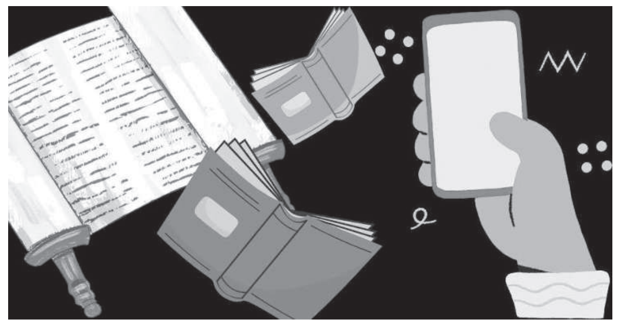
VISUAL: TEENI AND TUNI

There are a few key traits that we should acquire as students to become digital citizens. We should be empowered learners with the drive to remain updated, be curious, and continuously adapt. We should know how to promote open and responsible collaboration in the digital world for effective knowledge transfer. We must acquire the skill to "cut through" a sea of big data and noise to find out the pertinent