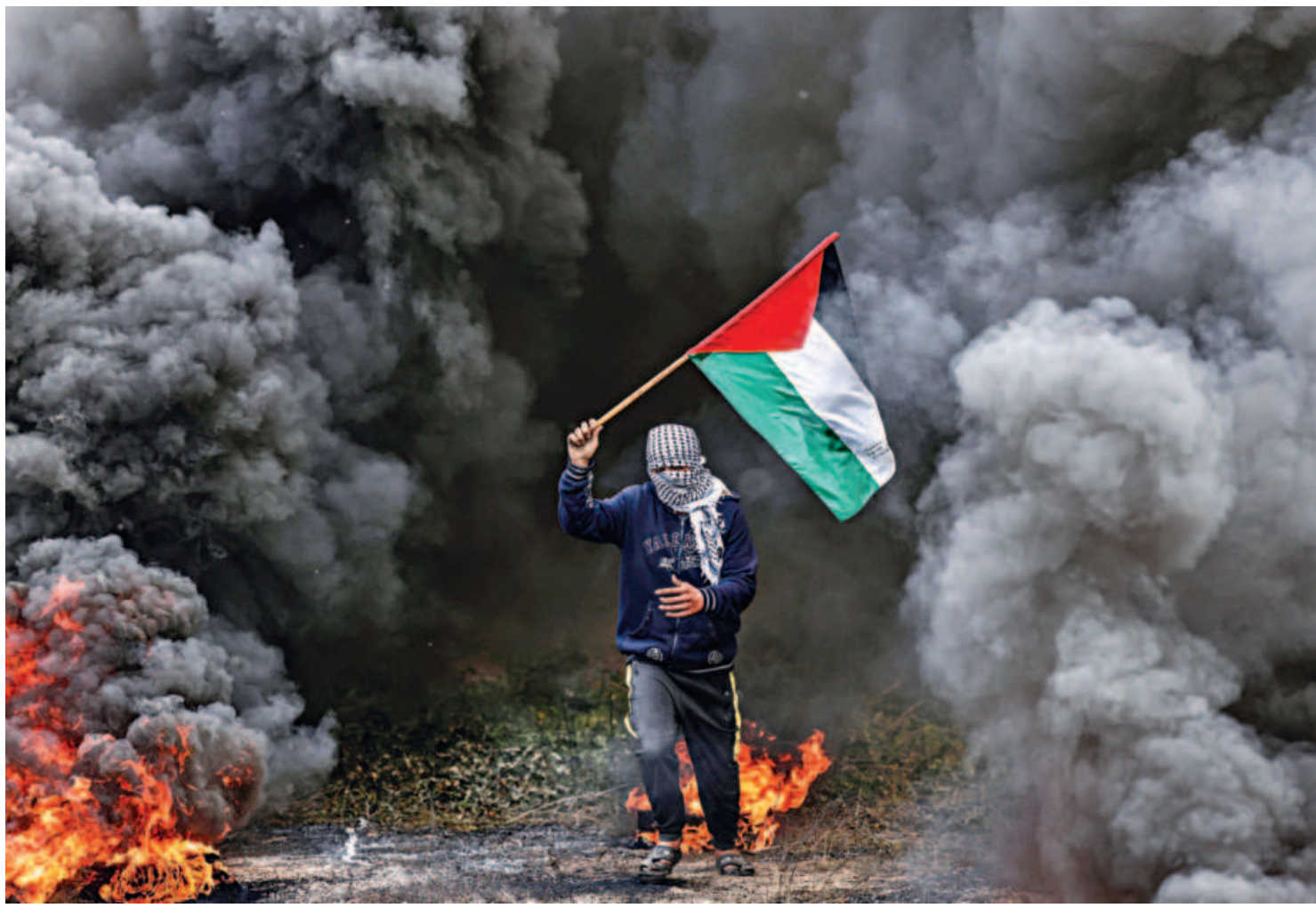
A Palestinian youth waves a Palestinian flag amid plumes of smoke during a protest near the Israel-Gaza border east of Jabalia refugee camp, yesterday.