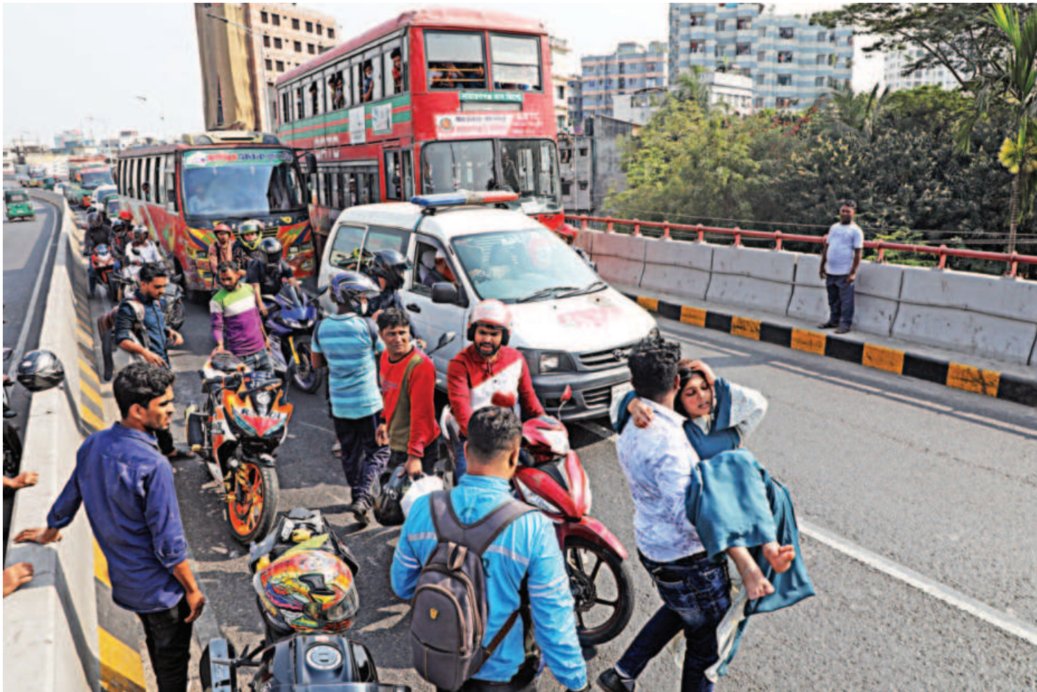
A man carries a woman towards an ambulance after she had an accident on Mayor Hanif Flyover yesterday afternoon. She fell off a motorbike while it was racing with another one on the flyover, according to witnesses. An ambulance, passing them by, stopped to take her to a hospital. Such risky and reckless driving could have easily resulted in a tragedy.