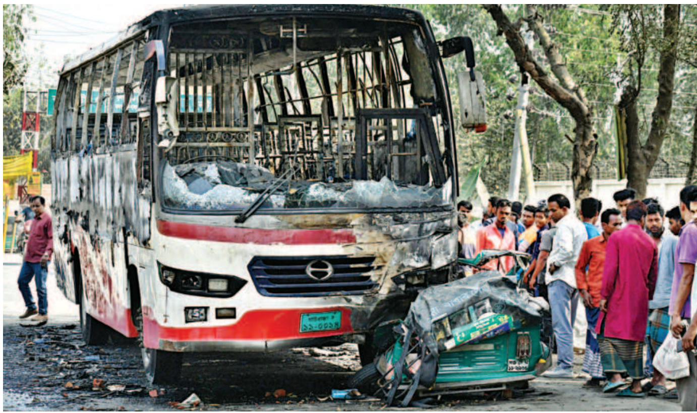
The mangled remains of an auto-rickshaw after it collided head-on with a bus in Sujabad-Dahapara area of Bogura's Shajahanpur upazila yesterday morning. The accident left the driver of the three-wheeler and its four passengers dead. The bus was set ablaze by angry locals. Story on page 12.

While Grameenphone officials said the network was disrupted for two hours, users have been complaining of connectivity issues since before 11:00am yesterday.