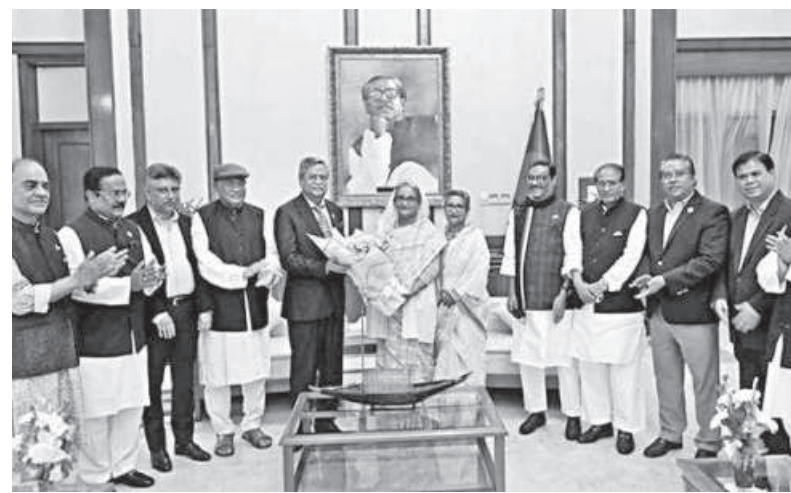
Shouldn't there be a difference between the way a party functionary is selected and the way a presidential candidate is?

Before every party election, the leader is given the sole power by the councillors and delegates to select nominees for every important post. In this case, too, the Awami League parliamentary party did the same, and so did the leader. Should a party position and the occupant of the highest constitutional post be filled in the same manner? Should it be so arbitrary, so narrowly focused, and so personalised?