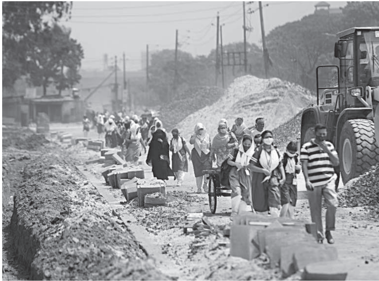
A development process that doesn't factor in measures to protect the environment is ultimately detrimental to people's well-being.