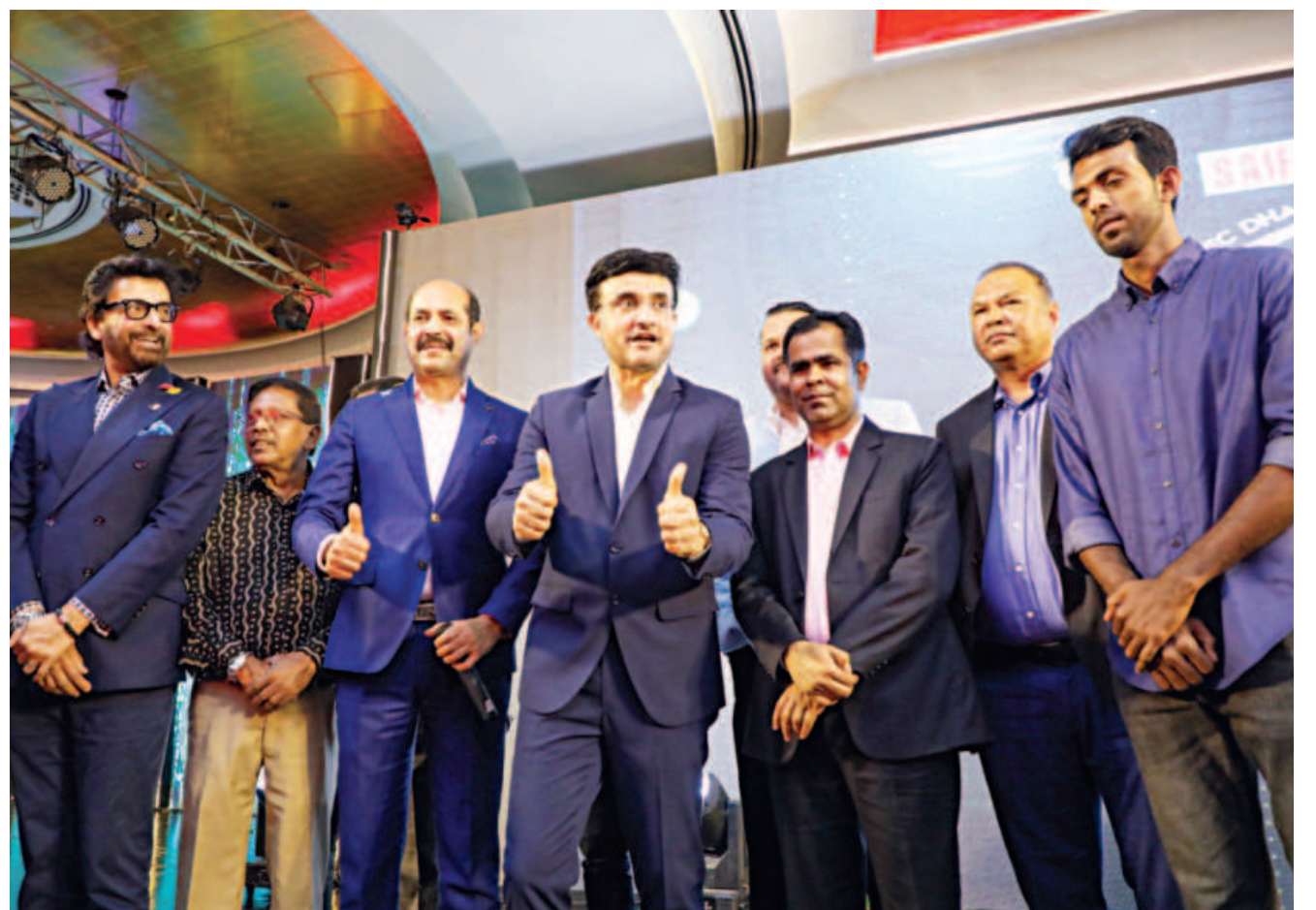
Former India captain Sourav Ganguly graced the grand inauguration programme of the DNCC Mayor Cup 2023, set to begin next month, as the chief guest on Thursday. Overwhelmed by the reception, the former BCCI president said: "The thing is that whenever I come to Bangladesh, I get the love of so many people that I don't know whether I am in India or Bangladesh."

"The Premier League is the best mark and most successful league in the world. It gives more to the lower leagues and the PFA (Professional Footballers' Association) and the grassroots than any other top league in the world. It's a fantastic export."