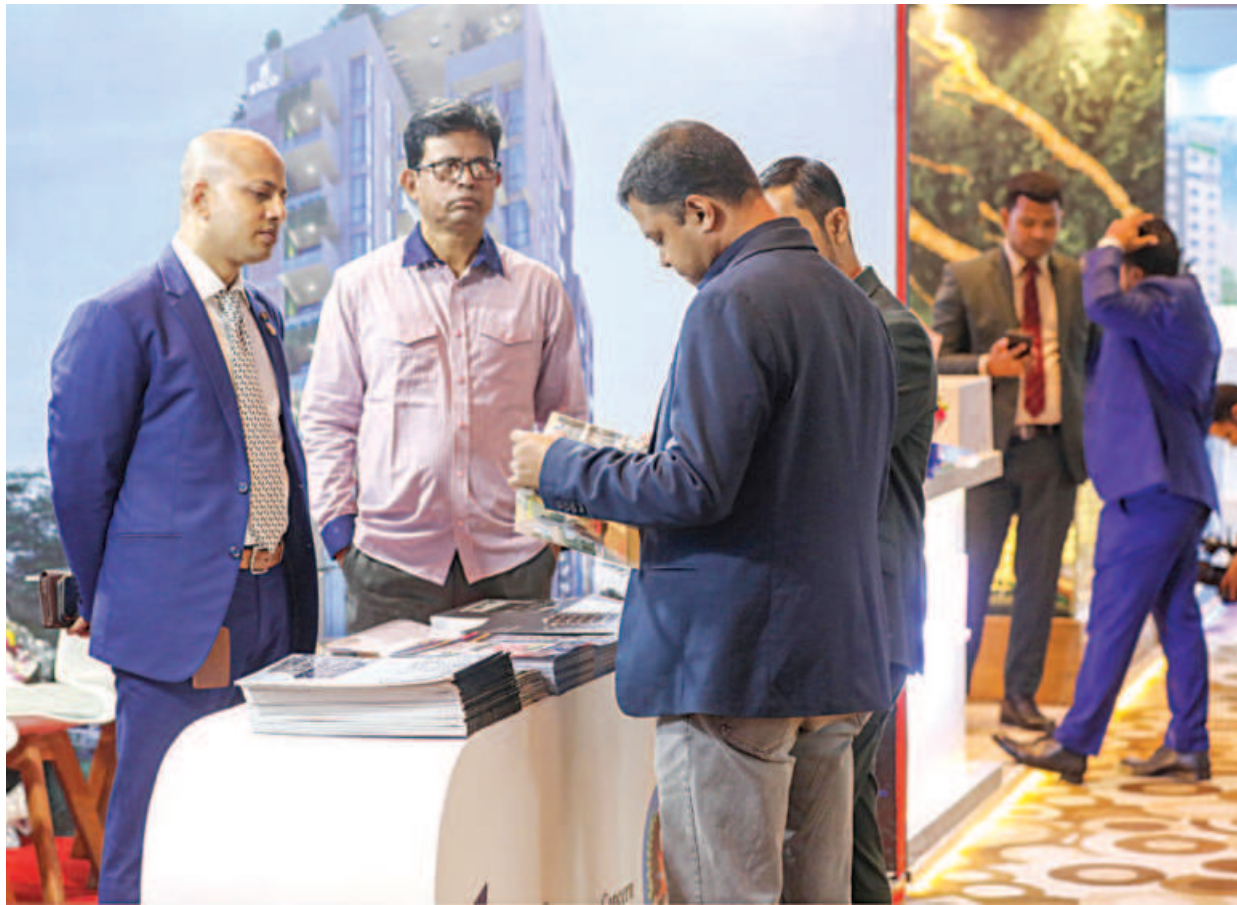
Visitors through REHAB Chattogram Fair 2023 that kicked off at the Radisson Blu Chattogram Bay View hotel in the port city yesterday. Some 48 companies, including real estate firms, building material makers and financial institutions from Dhaka and Chattogram, are participating in the four-day show that will remain open from 10am to 9pm.