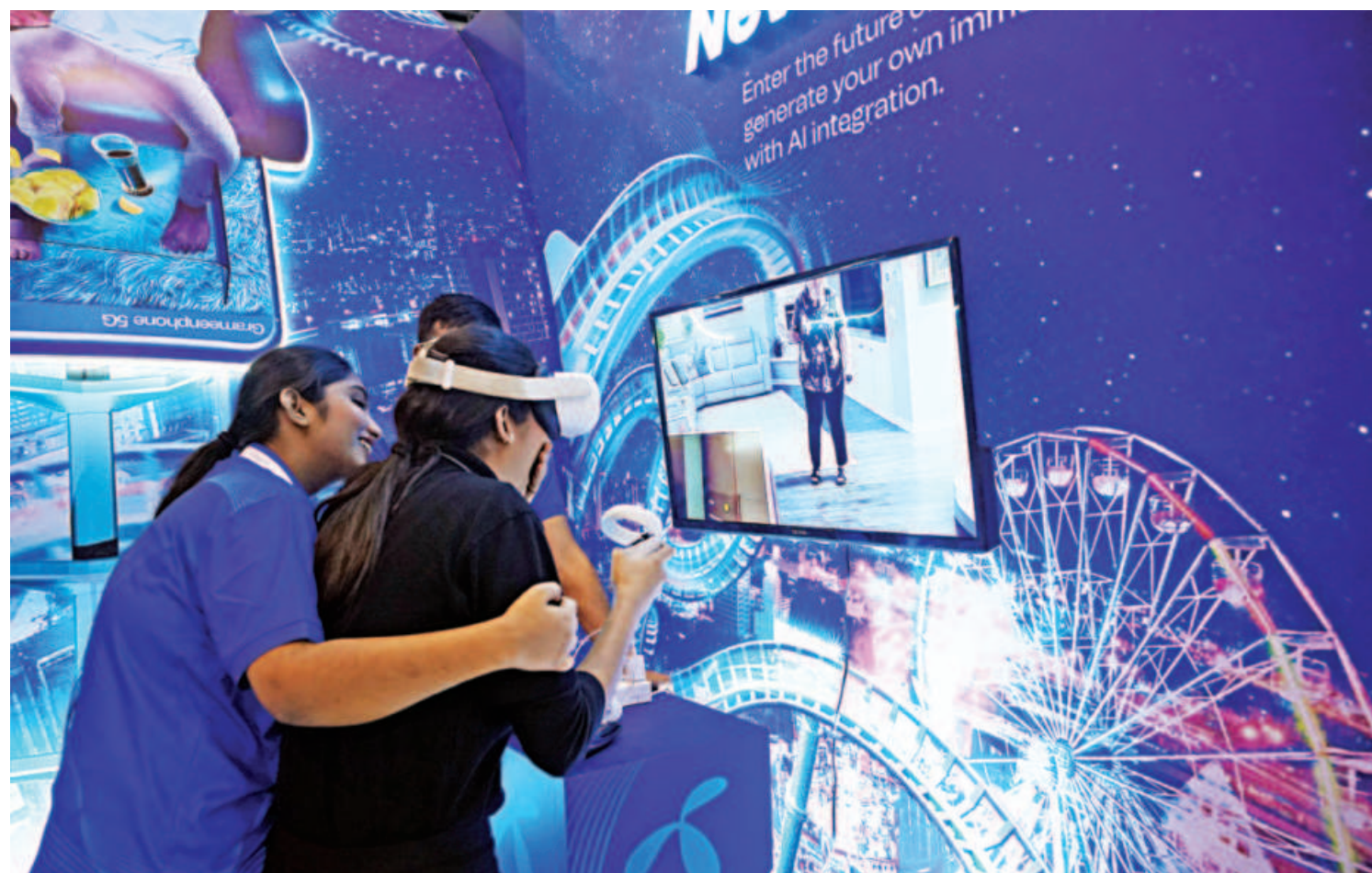
A visitor is seen trying out a virtual reality headset at the BASIS SoftExpo 2023, which began at the Bangabandhu Bangladesh-China Friendship Exhibition Center in Dhaka's Purbachal yesterday. More than 200 stalls have been installed at the fair, where participants are showcasing products and services of the latest technologies.