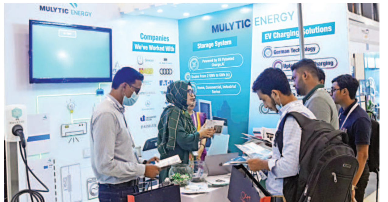
Visitors make queries at a stall of BASIS SoftExpo 2023 in the capital yesterday.