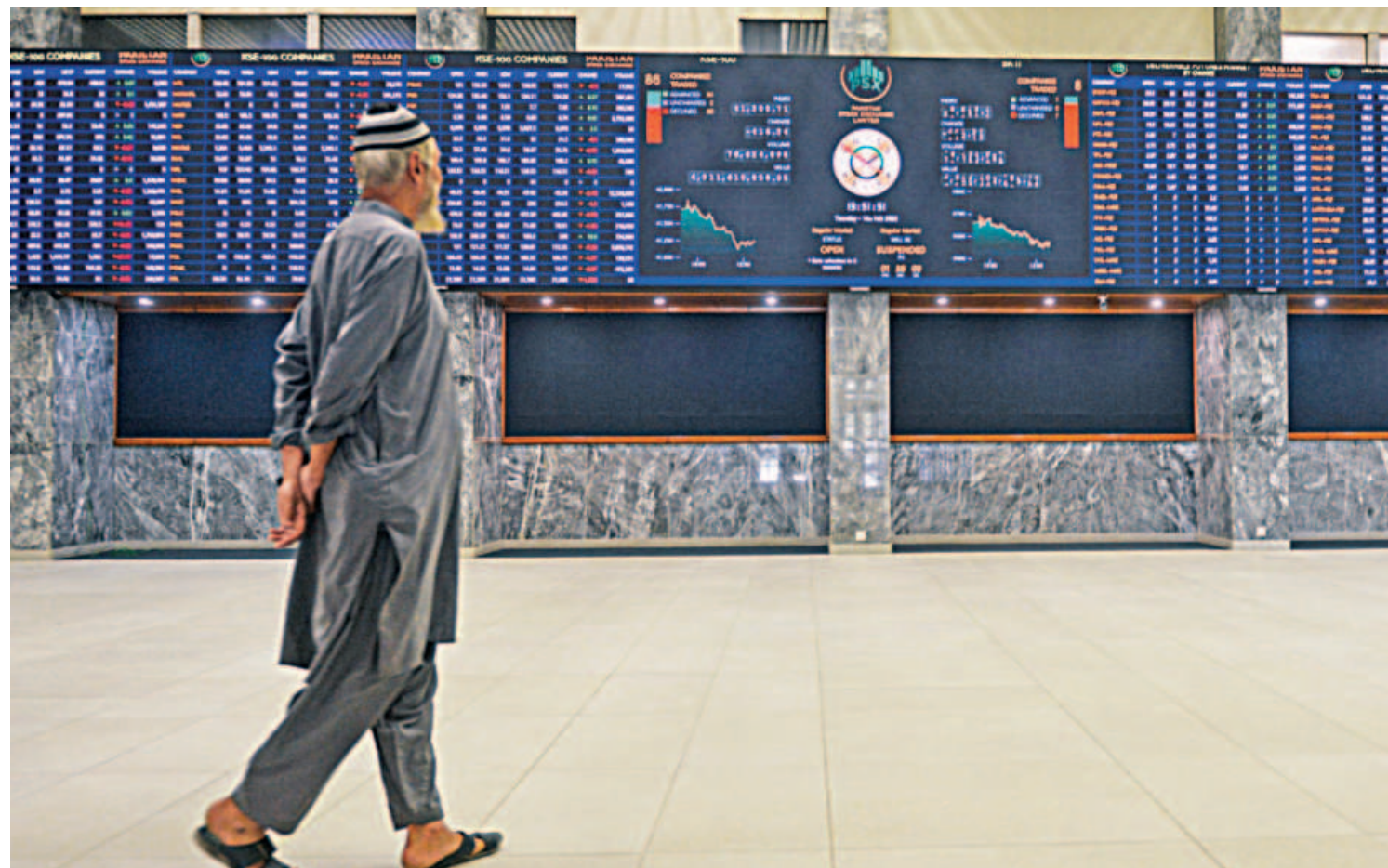
A man looks at an index board showing the latest share prices at the Pakistan Stock Exchange in Karachi on February 14. Pakistan's central bank is set to raise interest rates as early as this week in an off-cycle review, investors said, as the South Asian nation faces pressure to mend its finances amid a $1 billion loan it is seeking from the International Monetary Fund.