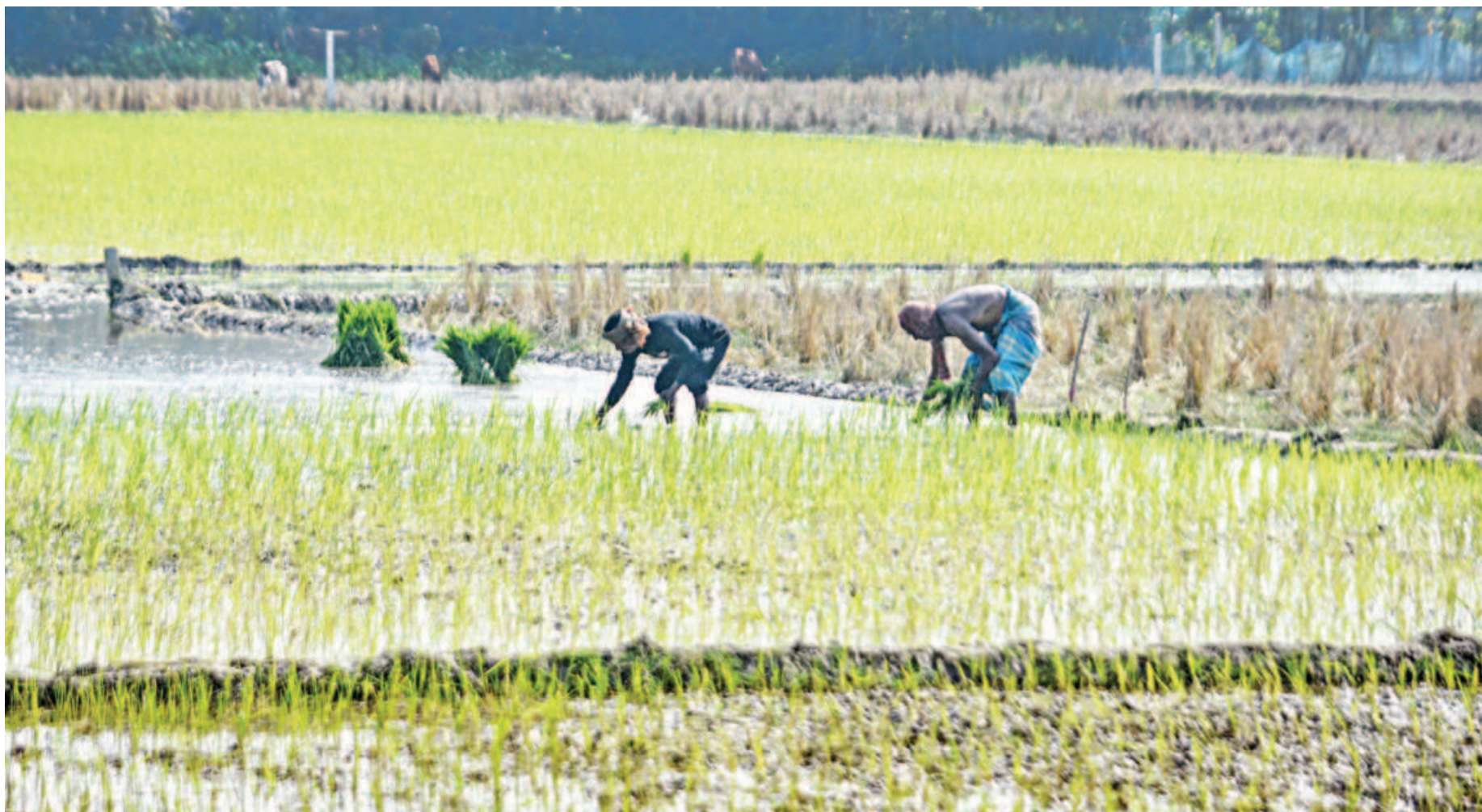
Workers are seen planting Boro paddy saplings in Batiaghata upazila of Khulna as the ongoing planting season is nearing an end. Experts say that delays in the release of crop data have led to uncertainties in ensuring food security. The photo was taken yesterday.