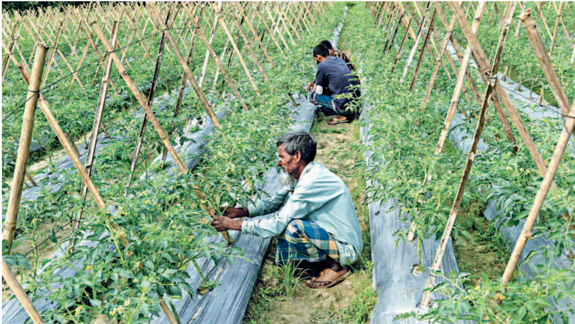
Farmers tend to a field of vegetables which has adopted mulching, an effective way of insulating and protecting delicate plant root systems against harsh weather conditions. Here plastic film is used to create a barrier that improves the soil's nutrient profile and reduces erosion while enhancing the soil's ability to hold more moisture. The photo was taken at Hatkhula union of Sylhet sadar upazila recently.