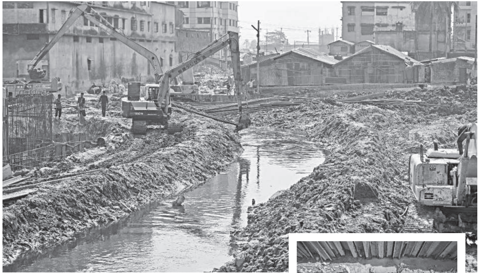
Only a few millimeters of rain in Chattogram is enough to wash away the authorities' lofty claims of monsoon preparedness, as the majority of the city gets submerged. Chattogram Development Authority launched a project in 2018 to excavate and clean all canals in the port city to address the perennial problem of waterlogging. However, due to the slow progress of the work, city dwellers fear they will most likely suffer the same fate during this monsoon. The photos were taken in the Rajkhal canal area of Bakolia.